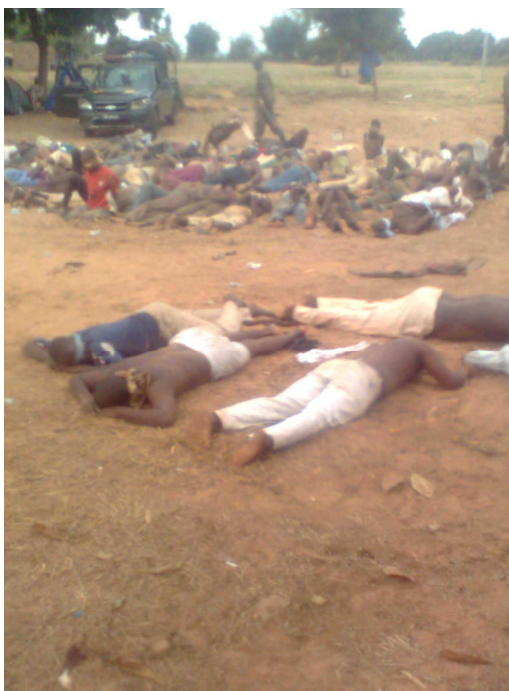
Potiskum, October 2013, people killed by the security forces in a military operation in Yobe state.

In a situation of non-international armed conflict, Nigeria remains bound by its obligations under international human rights law. And all parties to the conflict, including non-state armed groups such as Boko Haram, are bound by the rules of international humanitarian law (IHL).