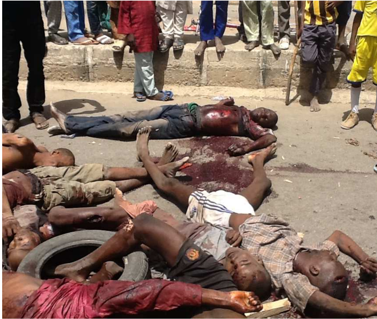
Former detainees shortly after they were re-arrested by the “civilian JTF” and executed by the security forces in Jiddari Polo area in Maiduguri on 14 March 2014.