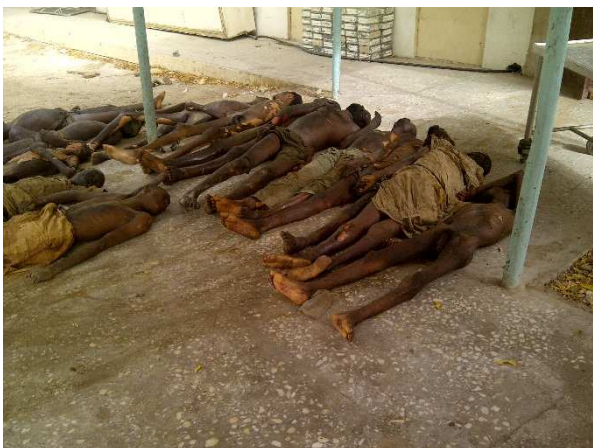
Corpses of detainees from Giwa Barracks, brought by the military to the mortuary in Maiduguri, April 2013.