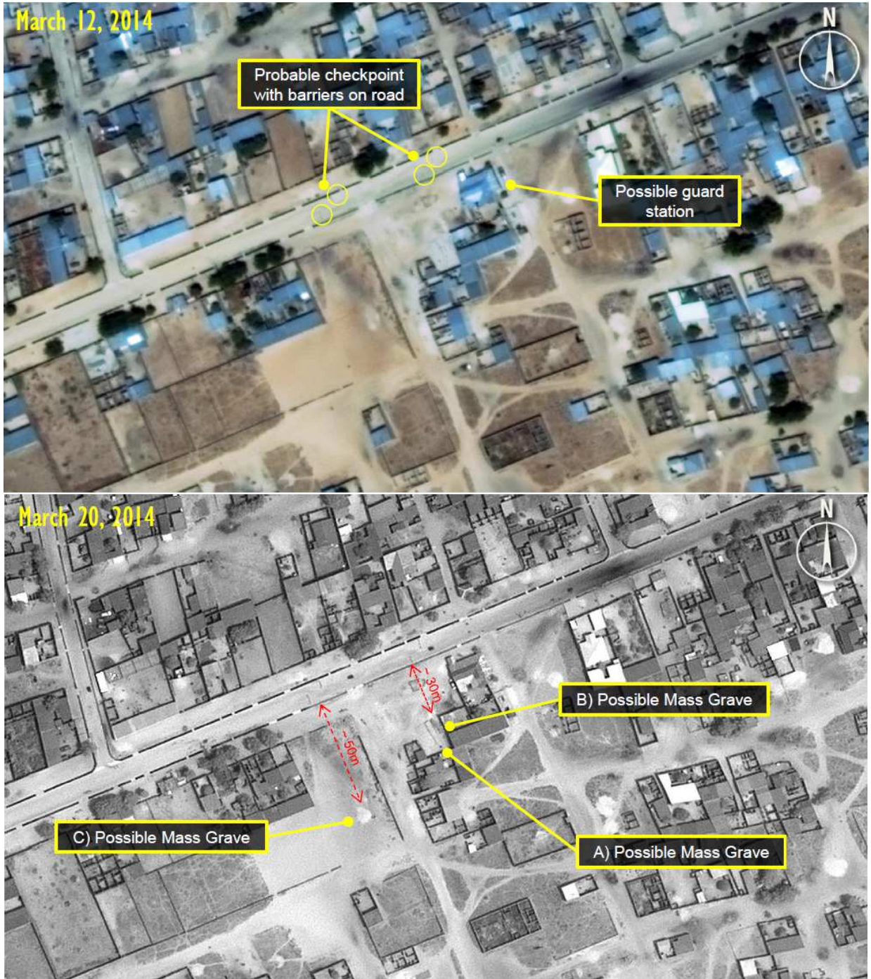
Top: Satellite images from 12 and 20 March 2014. A probable checkpoint is observed behind the UMTH. New areas of disturbed earth can be seen between March 12 and March 20, 2014. Measurements of the possible grave sites are: A) 12x2 meters, B) 8x2 meters, C) Diameter is 6 meters.