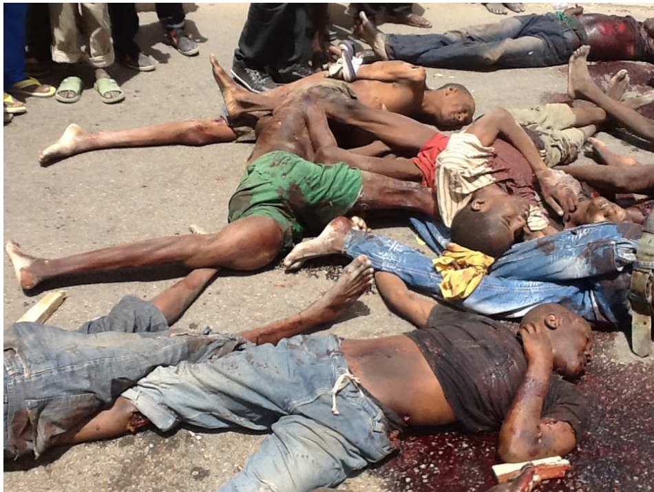
Former detainees shortly after they were re-arrested by the “civilian JTF” and executed by the security forces in Jiddari Polo area in Maiduguri on 14 March 2014.