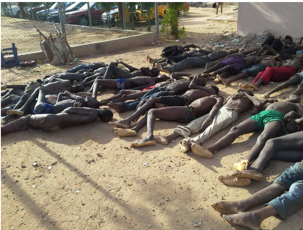
Bodies of detainees from 'Guantanamo' (sector Alpha detention centre) in Damaturu, Yobe state, June 2013. None of the bodies had gunshot wounds and according to a senior military officer these bodies were among 47 detainees who died of suffocation in one day.