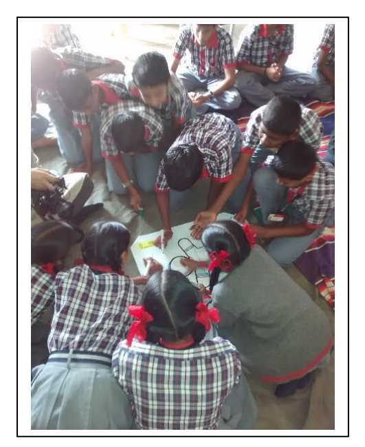
BullyNoMore body mapping activity Kerala, India, December 2014

The Human Rights Education programme at Amnesty International India kick started their Human Rights Month