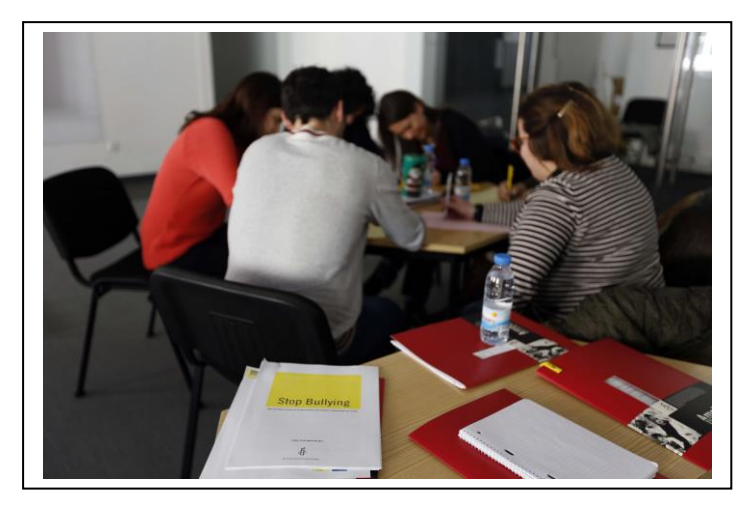
Group work, training of activists, STOP Bullying! project, Lisbon, Portugal, January 2015

We have minor problems with fitting in with the annual plan of the schools as it is set in September, but we are ready to adapt to local circumstances. In the scope of Amnesty's 'STOP Torture' campaign we are organising a guided visit to Fort of Peniche. This site had been the scene of detention and torture of people seen as threat to the Salazar dictatorship. There is also an expansion of the