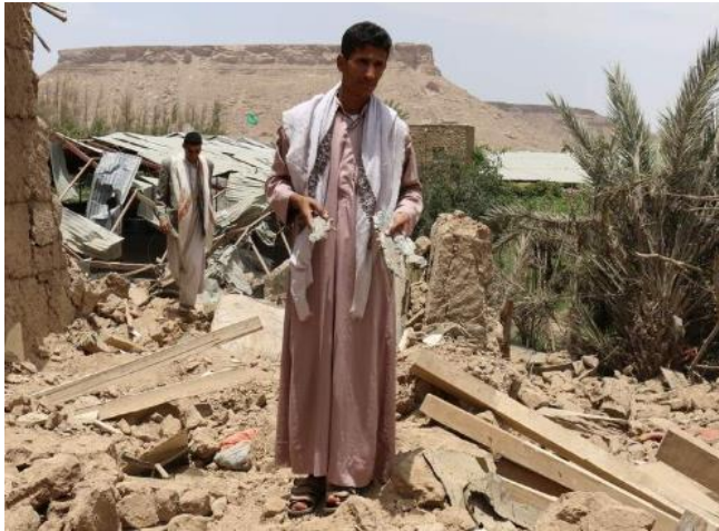
A member of the al-Sailami family stands in rubble of destroyed house in al-Safra, Sa'da.