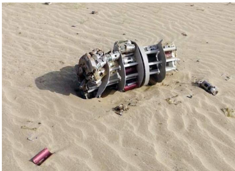
The remains of the body of a UK-manufactured BL-755 cluster bomb in Hajjah in northern Yemen

Amnesty International's research team located the BL-755 bomb in Hayran in the centre YEMAC was using to store unexploded ordnance they had collected. The bomb had malfunctioned and bomblets in five of the original seven sections had neither dispersed nor detonated as designed. Around a dozen bomblets were still inside in the crushed remains of the bomb casing and YEMAC had stored another 70 or so bomblets in the same facility indicating that 80 or so bomblets, more than half, failed to detonate.