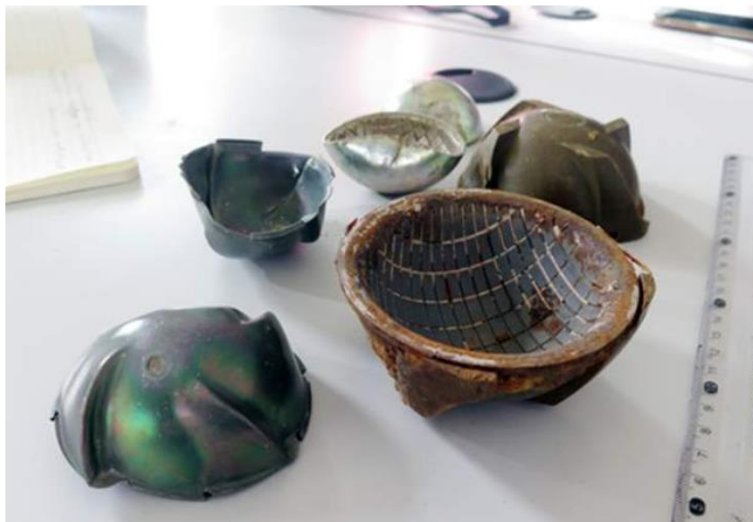
Remnants of cluster bomb submunitions at the Yemen Executive Mine Action Center (YEMAC) in Sa'da.

"[Different] types of cluster munitions have been used [by the coalition] but we have only worked with four of the types before. We were surprised by the new kind. They are more sensitive... It is difficult to get explosives to detonate the bombs but storing them is dangerous" he said. "We need to bring in trainers from the countries that made the weapons to train the employees...[and] we are looking for better technology to destroy these bombs."