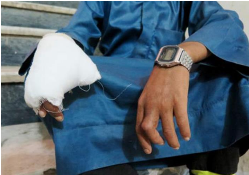
An 11-year-old survivor of a submunition incident, which severed three of his fingers and broke his jaw. His eight-year-old brother was killed instantly.