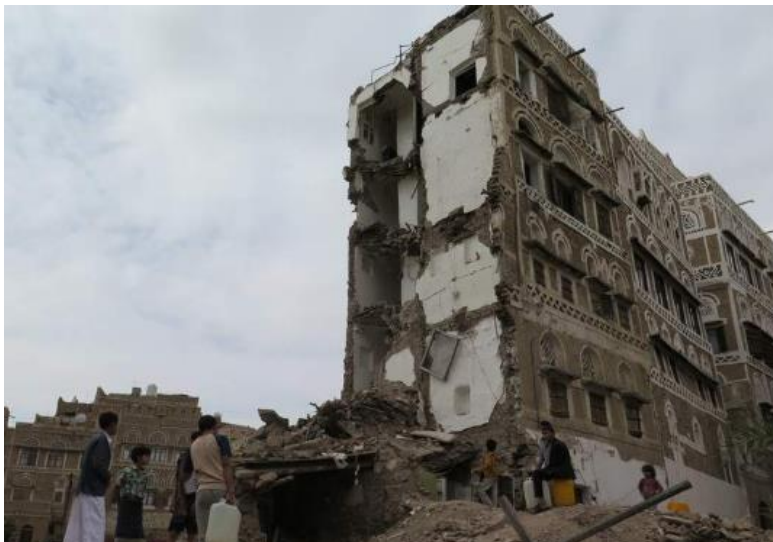
A coalition strike in Sana'a Old City, destroyed four adjacent houses on 12 June 2015 killing five members of the Abdelqader family ©Amnesty International.

The Saudi Arabia-led coalition spokesman Brigadier-General Ahmed al-‘Assiri denied responsibility for the strike but a fragment of the bomb recovered from the rubble of the houses shows that it comes from a 2,000 lb (900 kg) bomb, the same type which has been widely used by the coalition in various parts of Yemen.