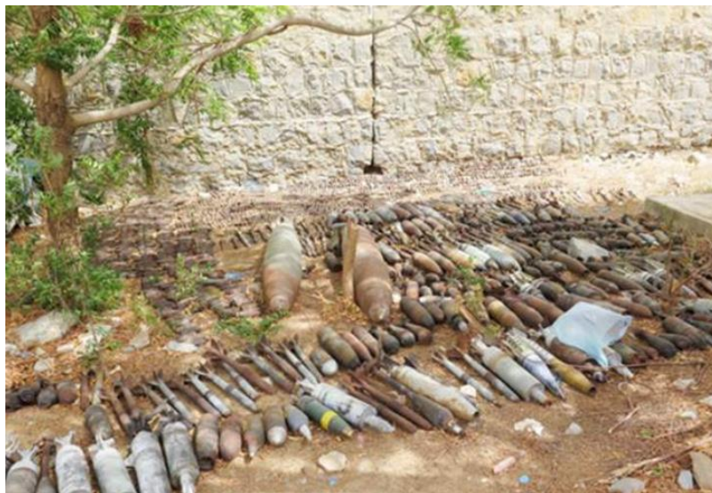
Explosive Remnants of War in the garden of the Yemen Executive Mine Action Center (YEMAC) in Hayran

While the full extent of cluster munition contamination is not yet known, in the first three weeks of their work, YEMAC records show its teams working in Sa'da and Hajjah governorates cleared at least 418 cluster bomb submunitions, 810 fuses and artillery remnants, 51 mortars and more than 70 missiles.