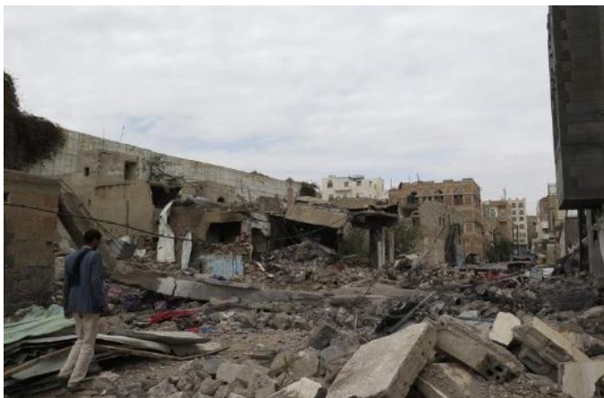
Destruction in the Mi'yad neighbourhood resulting from an airstrike on 13 June, killing five members of the al-Amiri family

Eyewitness testimonies from the aftermath of these and other strikes provide yet more damning evidence that coalition forces are failing to take necessary precautions to minimize civilian deaths and injuries when they target military installations in areas controlled by the Huthi rebels and forces loyal to the former President. In fact, some of the apparent intended targets, such as homes owned by relatives of former President 'Ali 'Abdullah Saleh, do not appear to be military objectives or at least do not appear to be of sufficient importance to warrant the risk attacking them poses to civilians and civilian objects in the immediate vicinity.