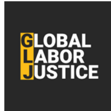
Global Labor Justice