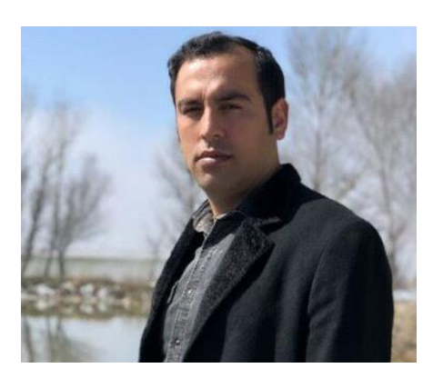
Asgar Akbarzadeh © Private

They told the activists: "You are criminals. You get orders from the United States." Some of them were put into solitary confinement. All were forced to sleep on the floor and kept in poor conditions of detention with their hands tied behind their backs until their release.