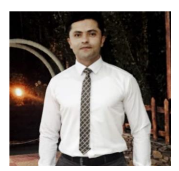
Hamid Abid © Private

Kiumars Eslami has also been arrested a number of times previously because of his peaceful activism calling for greater respect for the rights of the Azerbaijani Turkic minority in Iran.