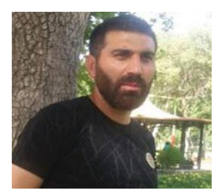
Mehdi Houshmand © Private

Amnesty International has obtained eyewitness testimonies describing how security forces used violence against activists they had arrested in and around Kaleybar, including beatings with batons and wooden sticks, kicks and punches to the head, back, chest, and stomach, as well as the use of pepper spray and electroshock weapons.