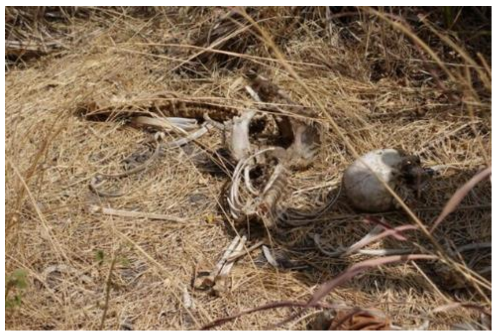
Human remains at the Kulier site found by Amnesty International.

Amnesty International commissioned a forensic analysis of the images of the remains taken by Amnesty International researchers in Leer on 11 February 2016. The forensic analysis was consistent with witness statements regarding the time of death and decay and the evidence of scavenging.