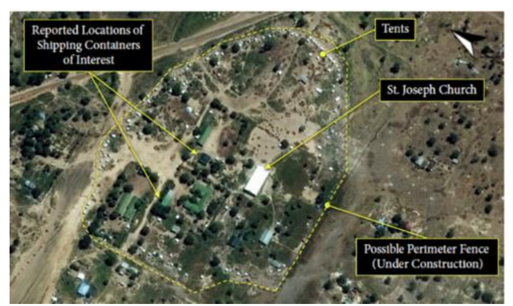
Satellite image of the Comboni Catholic Church compound where detainees were held by government forces.

Witnesses most consistently told Amnesty International researchers that they saw the detainees who subsequently died being held in the red container on the side of the compound used by the Comboni Sisters. The then-commissioner of Leer County, who was not present in Leer during the incident, told Amnesty International researchers that he subsequently requested an internal report about the killings. He told Amnesty International researchers that he was told the detainees who died were held in the red container on the Comboni Sisters side of the compound. Some witnesses however, said that the detainees who died were in a blue container or in a red container on the Brothers' side of the compound. All of the containers that witnesses described did not have any visible air holes or ventilation systems. Amnesty International was not able to determine whether the detainees who died were held in different containers on the church compound, but it is clear that at least some of these detainees died in the red container on the Sisters side of the church compound.