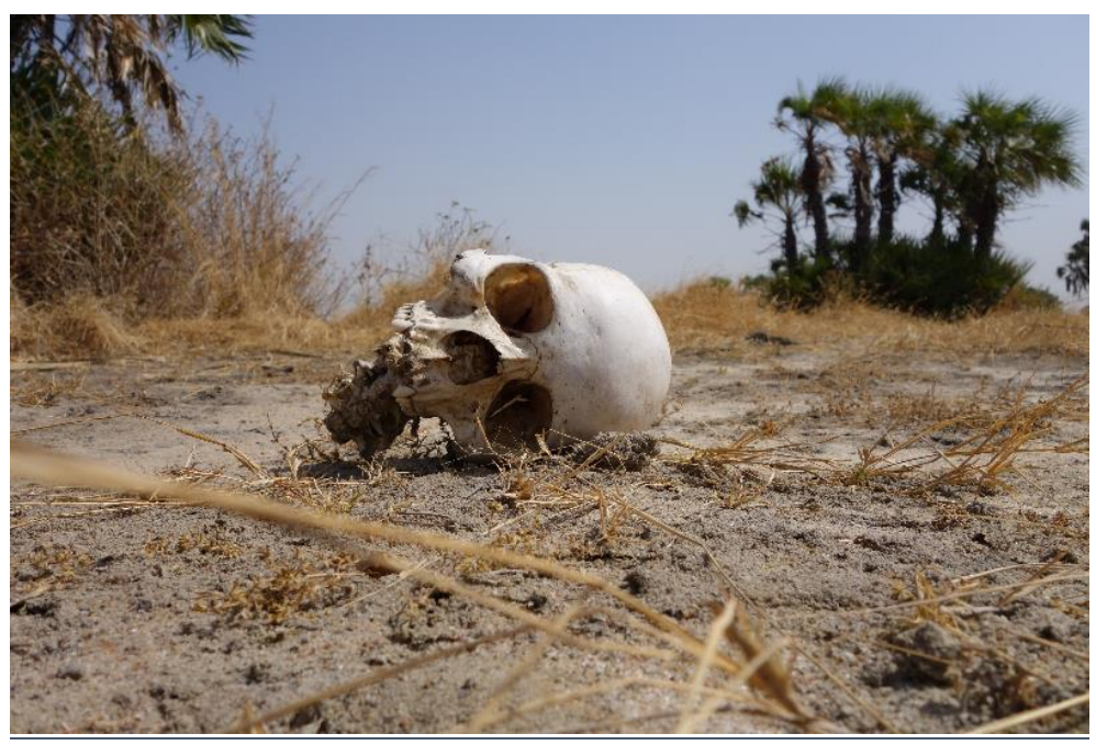
Human remains at the Kulier site found by Amnesty International.

Amnesty International researchers visited Kulier in Joung payam where witnesses said the bodies of the deceased were dumped by government forces in two pits. Amnesty International researchers observed human remains at the site. Remains were strewn outside of the pits identified by witnesses, very likely having been dragged there by scavenging animals.