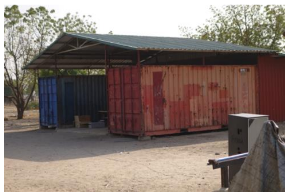
Two shipping containers in the Comboni Catholic Church compound seized by the government in Leer town, Leer County, Unity State. The red container was repeatedly identified by witnesses as the one used by government forces to hold detainees in October 2016 until they died from suffocation. Amnesty International, 11 February 2016.

Amnesty International researchers observed four shipping containers in the Comboni Catholic Church compound. Two shipping containers, one red and one blue, were positioned next to one another, a short distance apart on the Comboni Sisters' side of the compound. The containers are under a tin roof and behind them there is a small rectangular office which witnesses described as the then-area commander's office.