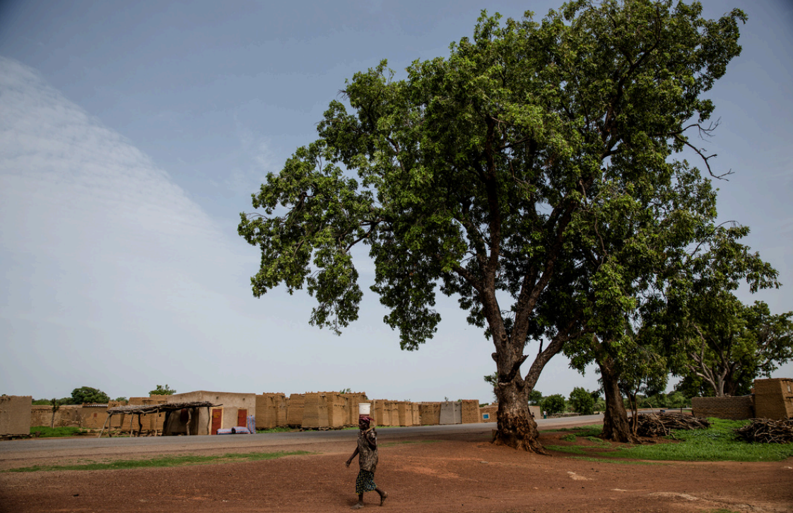
© Life in the village of Labien in Burkina Faso in 2018. Photo taken by Sophie Garcia