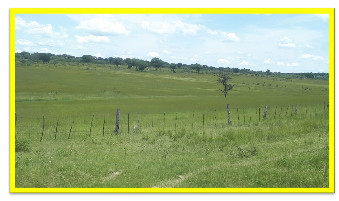
Vale de Chimbolela, the cradle of cattle. Amnesty International

The 8,150km² of the Gambos land mass is comprised of three parts. The first consists of rugged topography, predominantly rocky with patches of black and red soil in the west of highway EN-105. The second is a sandy topography locally known as Tunda dos Gambos which consists of slopes of grasslands and forests where the pastoralists graze their animals. The third is a valley known locally as Vale de Chimbolela (or mulola ), located farther east with abundant grass and water.<sup>88</sup> In the local language, Chimbolela means "the place where the food gets rotten in my possession because it is plentiful, and I cannot eat it all." Historically, Chimbolela had abundant grass and water for the animals to eat and drink year-round, even during prolonged droughts. For this reason, the pastoralist community dubbed Chimbolela as the valley of miracles; the valley of life; and tyimbelekela tya ngombe , that is, "the cradle of cattle."