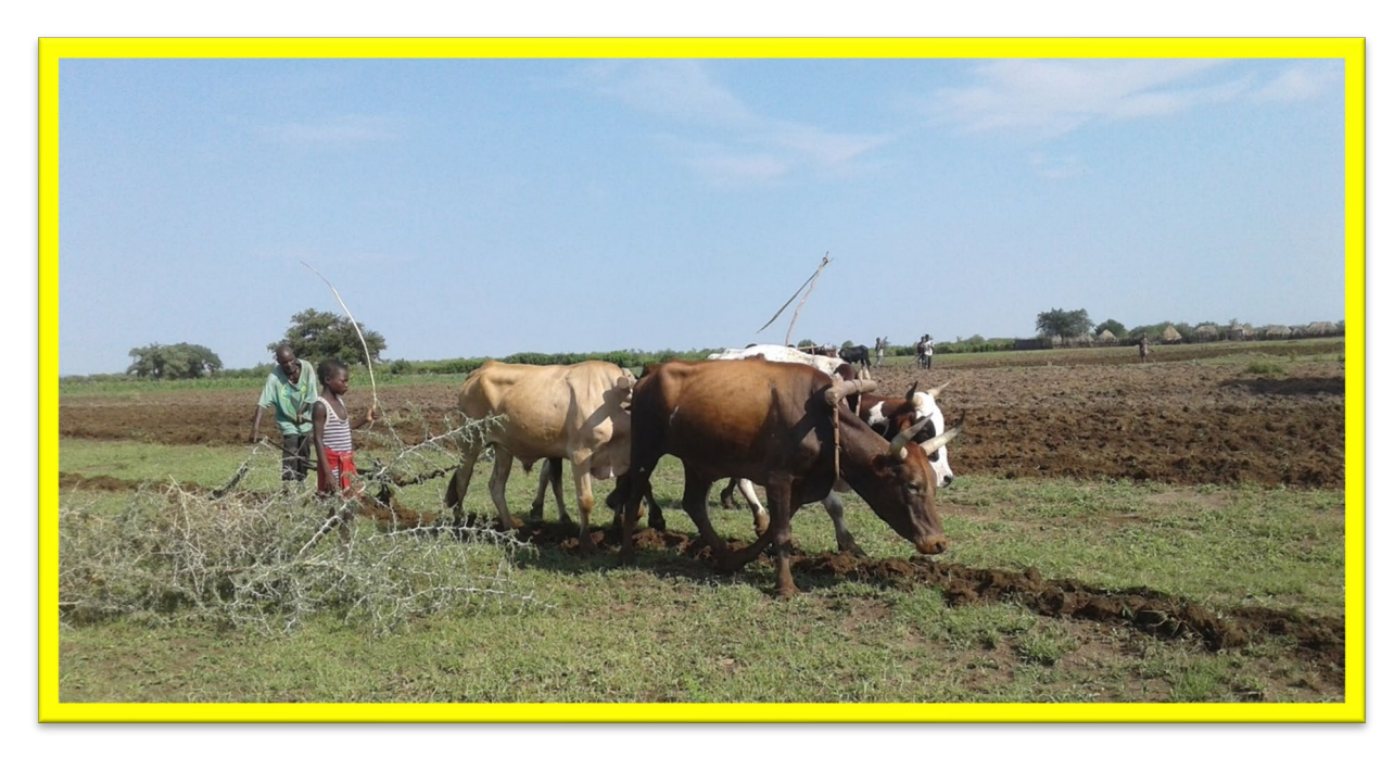
Oxen pulling a plough in the Gambos, Huila.

We use cattle as tractors to pull the plough in the fields. Imagine a family without cattle – they must depend on those who have cattle to plough the fields. However, as you can see, the cattle are not fat and robust as they used to be. Look at them. They are skinny and weak because there is not enough for them to eat. Now they cannot pull the plough as good as they used to in the past. Things have really changed around here. 105