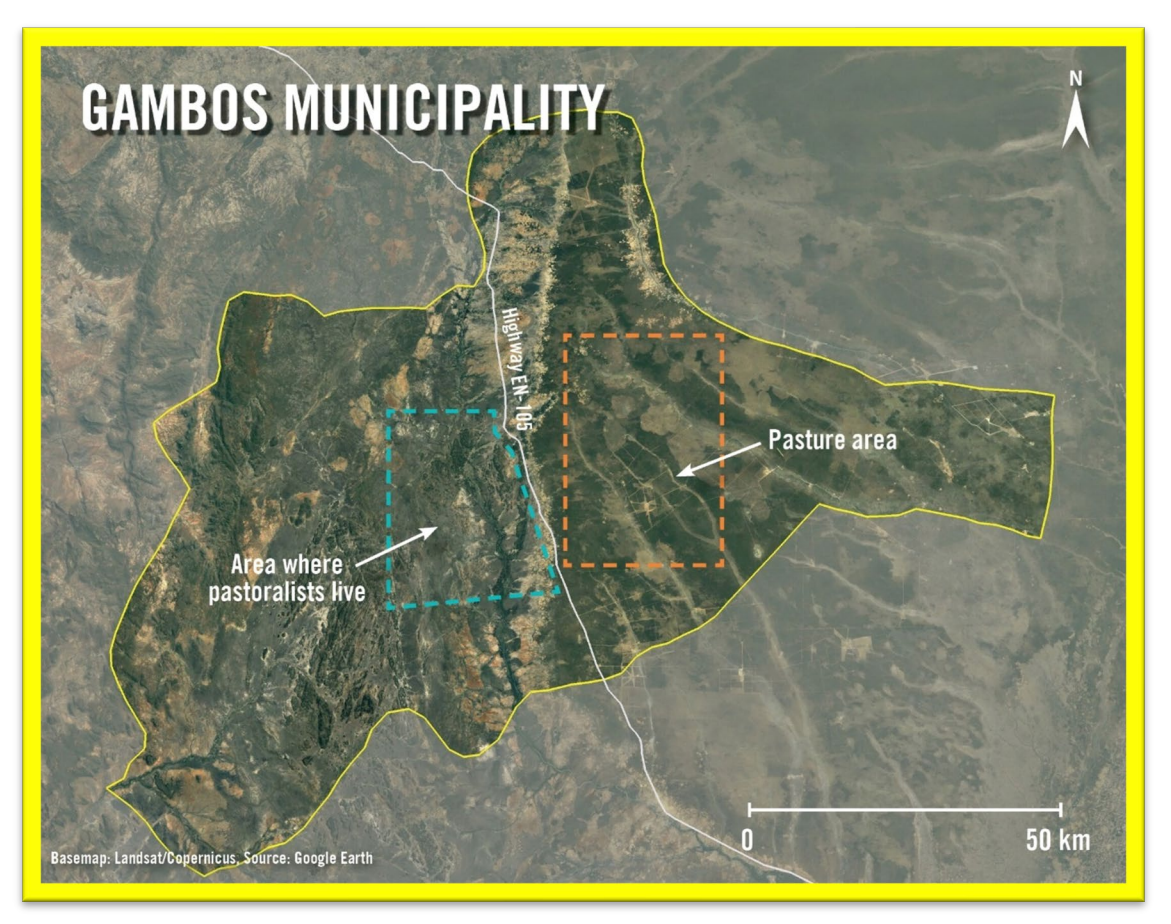
Map of the Gambos Municipality.

This report examines the violation of the right to food among the Vanyaneka and Ovaherero pastoralists in the Gambos municipality, Huila province, southern Angola, in the context of grazing land dispossession for commercial livestock farming. Like the rest of southern Angolans, the Gambos is known for its traditional cattle breeders, also called pastoralists , and is part of the milk region , <sup>23</sup> so described colloquially owing to the traditional cattle breeders' practices of harvesting, processing, and consuming milk and its derivatives (fat, yoghurt and cheese). These pastoralists are part of two major ethnic groups: The Vanyaneka whose subgroups include Vangambwe, Vakwankwe, Vatyilenge, Vahanda, Vatyipungo, Vandongwena, Vamwila, and Vakumbi; and the Ovaherero whose subgroups include Vakuvale, Vandzimba, Vahakavona, Vahimba, Vakavikwa, and Vakwando.