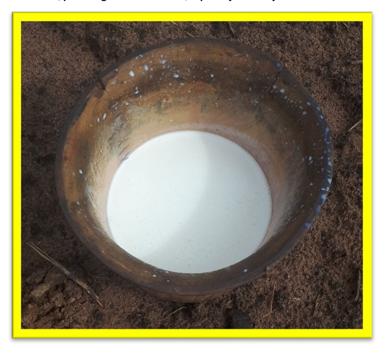
Wooden milk container in the Gambos, Huila.

You see this container (wooden container). This is a 5¢ container. I finished milking already but as you can see I only milked about 1€. Back in the days, I could fill this container by milking one cow only. That is when the cattle had enough to eat. That is when there was enough grazing land. But since the commercial livestock farmers came and occupied the Tunda, the cows have been eating less and less, producing less and less milk, especially in the dry seasons like now. 45