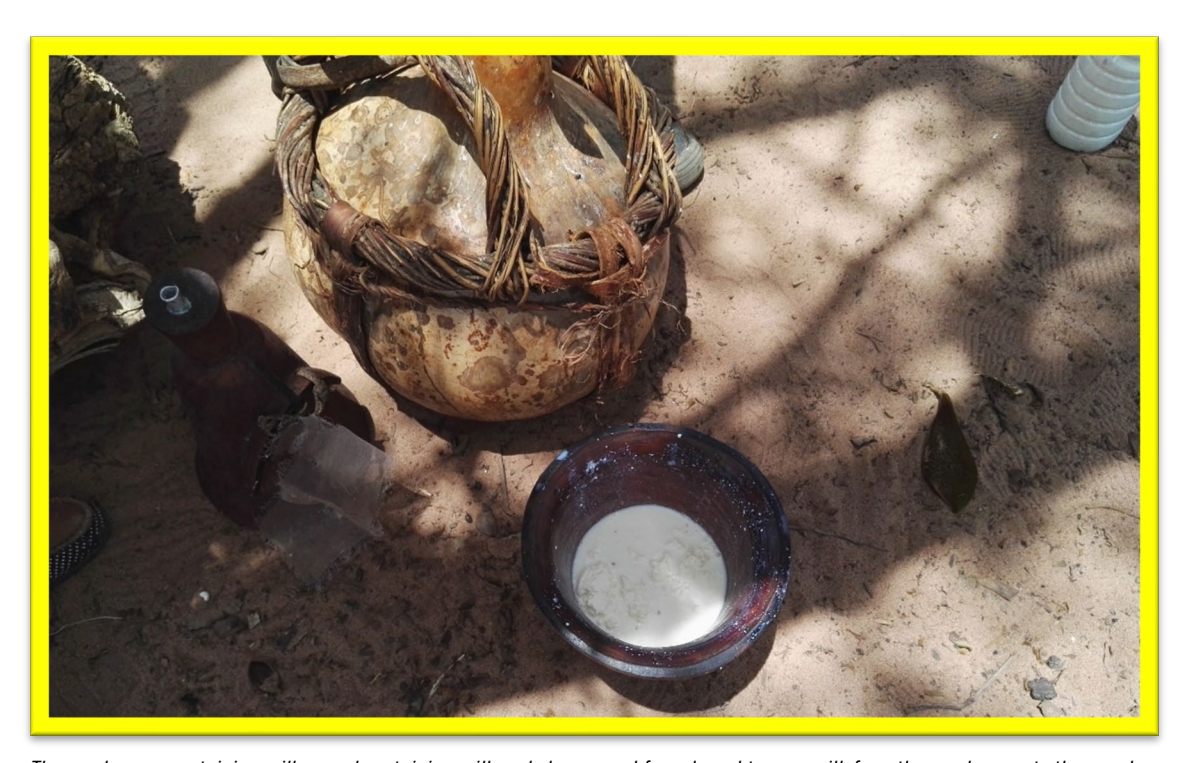
The wooden cup containing milk, gourd containing milk and cheese, and funnel used to pour milk from the wooden cup to the gourd and bottles. The gourd is used to conserve and process milk. Apart from the plastic bottle, the Vanyanekaharvest these domestic utensils from the surrounding forests.