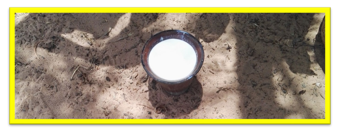
Cow milk in a wooden cup. Cow milk and its derivatives are part of the diet among the Vanyaneka in the Gambos. The wood used to make the wooden cup is harvested from the surrounding forests.

appreciation of what it means when one cow dies in these families. Cows are the wealth of these families. Unlike us who live in the cities, in these communities, wealth is not measured by the amount of money in the bank, but by the number of cows. 103