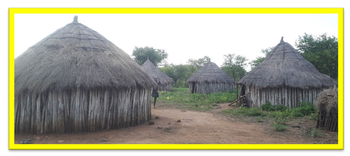
This is a pastoralist kimbo (homestead) in the Gambos, Huila.

pastoralists from the entire milk region – i.e., Cunene, Huila, and Namibe provinces – converge with their livestock in the Gambos, which explains the description of the Gambos area east of Highway EN-105 as zona de transumancia (the transhumance zone).