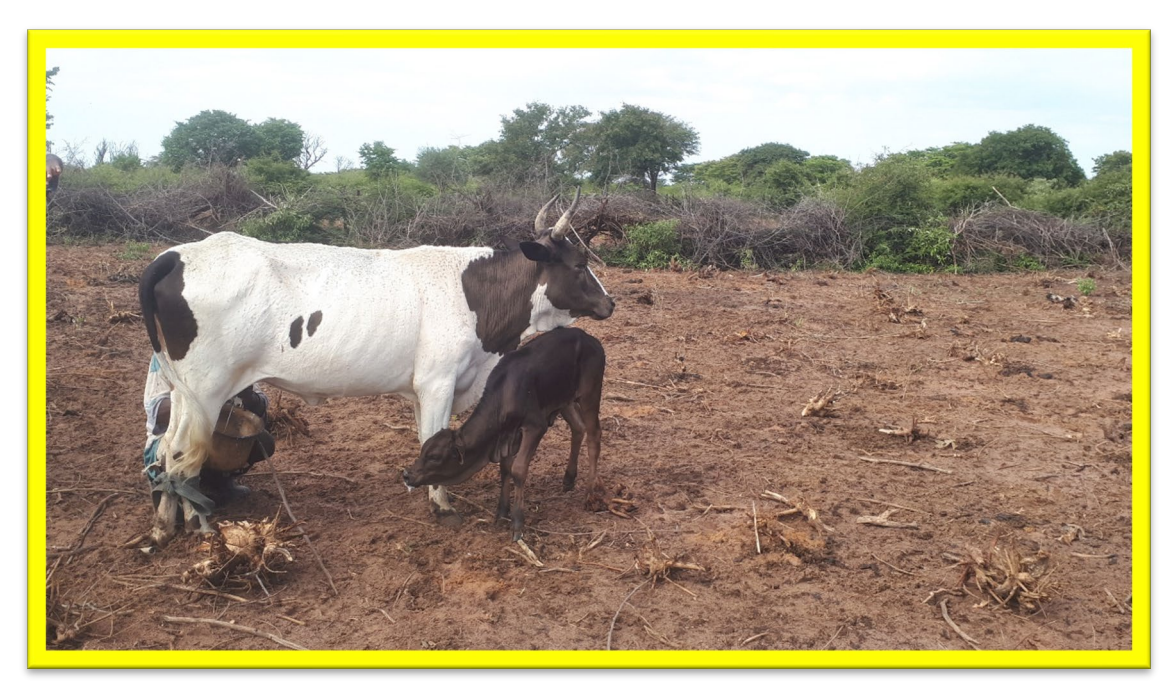
Pastoralist milking his cow in the Gambos, Huila.

The cattle are our transportation when we need to move heavy things. When we build a house, for instance, we use cattle to transport building material from the forests - in order to do that, the cows must be fat, healthy and robust. When someone is sick, we also use the cattle to take them to the hospital. 108