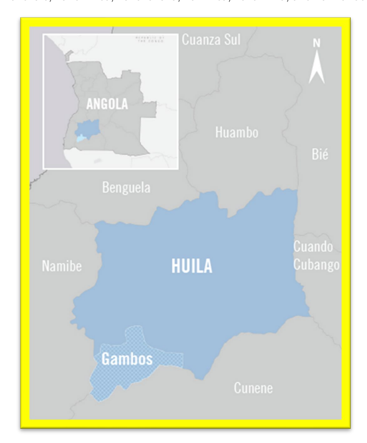
Map of Angola, Huila Province and Gambos Municipality.

In the southernmost end of Angola's southern province of Huila lies the Gambos municipality, the home of Tunda and Chimbolela, the customary grazing commons for the region's pastoralists. Traditional cattle breeders from all the three provinces that comprise southern Angola – Cunene, Huila, and Namibe – can be found grazing their livestock here, particularly in dry and drought seasons. These traditional cattle breeders are part of two major ethnic groups: The Vanyaneka whose branches include Vangambwe, Vakwankhwa, Vatyilenge, Vahanda, Vatyipungu, Vandongwena, Vamwila, and Vankhumbi; and the Ovaherero whose branches include Vakuvale, Vandzimba, Vahakavona, Vahimba, Vakavikwa, and Vakwandu.