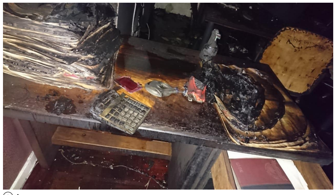
\textcircled{O} \uparrow Burned work station

\textcircled{O} \uparrow Burned work station