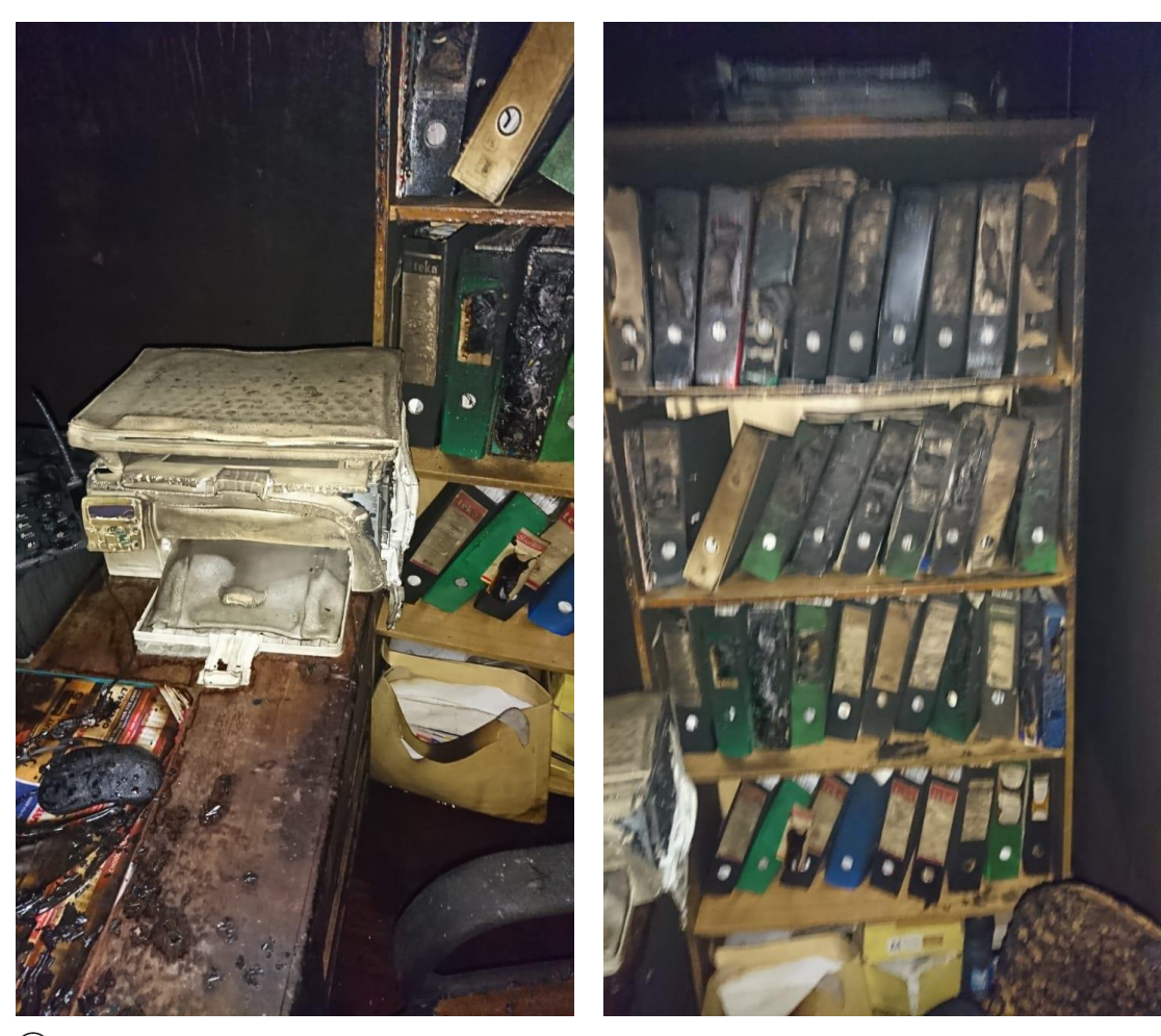
\textcircled{O} \uparrow Burned workstation and archives | @ Canal de Moçambique