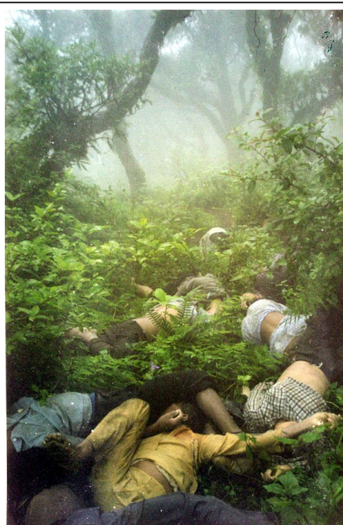
Bodies of people reportedly extrajudicially executed in Doramba village, Ramechhap district on 17 August 2003

Since the end of the cease-fire in August 2003 there has been a dramatic rise in human rights abuses by both sides. In the first nine months after the cease-fire ended there was an unprecedented number of “disappearances” as the security forces arrested hundreds of people and held them in secret detention in army barracks. Amnesty International received reports of over 400 people “disappeared” between August 2003 and June 2004, while the NHRC recorded over 700 “disappearances” in the year following the breakdown of the cease-fire. However, reports of new “disappearances” have fallen since the summer of 2004, while local human rights organisations have reported increasing numbers of extrajudicial executions over the last few months. There are fears that the security forces may be replacing the tactic of arrest and secret detention, which led to widespread “disappearances”, with the immediate killing of suspects. Such a shift in tactics may be because the international and domestic pressure on the issue of “disappearances” was making large numbers of secret detentions unviable or because security forces have arrested most of the suspects they wanted for information purposes following the end of the cease-fire.