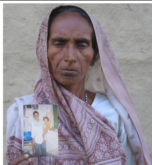
A woman holding a photo of her husband who was extrajudicially executed in October 2004

The first reports of extrajudicial killings by government forces emerged around one year after the beginning of the conflict. However it was during large-scale police operations in 1998 and 1999 that there began to be frequent reports of extrajudicial executions of CPN (Maoist) suspects by police. The number of extrajudicial killings declined markedly in 2000 and the first half of 2001, due partly to international pressure and partly to the fact that the demoralised and weakened police force remained mostly confined to barracks. However, following the declaration of the state of emergency and deployment of the RNA in November 2001 there was a dramatic increase in reports of extrajudicial killings by security forces.