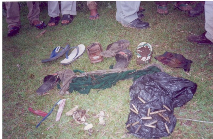
Clothes and bullets found at the scene of reported extrajudicial killings in Doramba village, Ramechhap district. August 2003

The widespread extrajudicial executions carried out by Nepal's security forces are made possible by the environment of impunity within which these security forces operate and their disregard for the rule of law. This impunity is created on a number of levels, as security forces on the ground hide evidence of killings, organisations attempting to investigate abuses face deliberate obstruction and practical difficulties, and mechanisms intended to safeguard against abuses are eroded. However, it is the failure of the highest levels of the government and military to ensure that abuses are investigated and those responsible are punished that is the most crucial factor enabling security forces to carry out extrajudicial executions secure in the belief that they will never be brought to justice for these crimes.