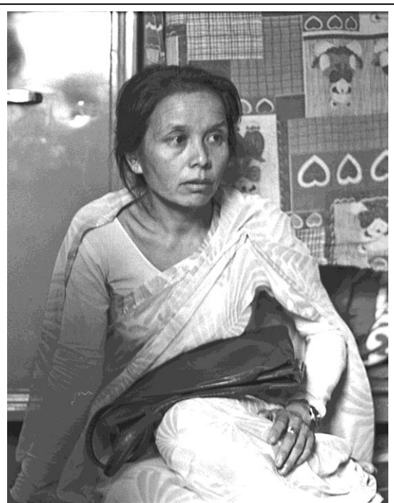
A woman whose husband was killed by CPN (Maoist).