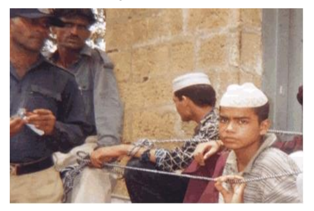
Alleged child offenders awaiting trial in Pakistan.

Although most of the outstanding death sentences imposed on child offenders before July 2000 have now been commuted, an unknown number of sentences are still outstanding while the courts determine the age of the convicted prisoners. Child offenders continue to be sentenced to death, mainly because their age has not been determined. The issue of age is generally not raised by the family's legal counsel until a child has been sentenced to death. Often judges do not raise the issue of age unless the child looks like a minor.<sup>12</sup>