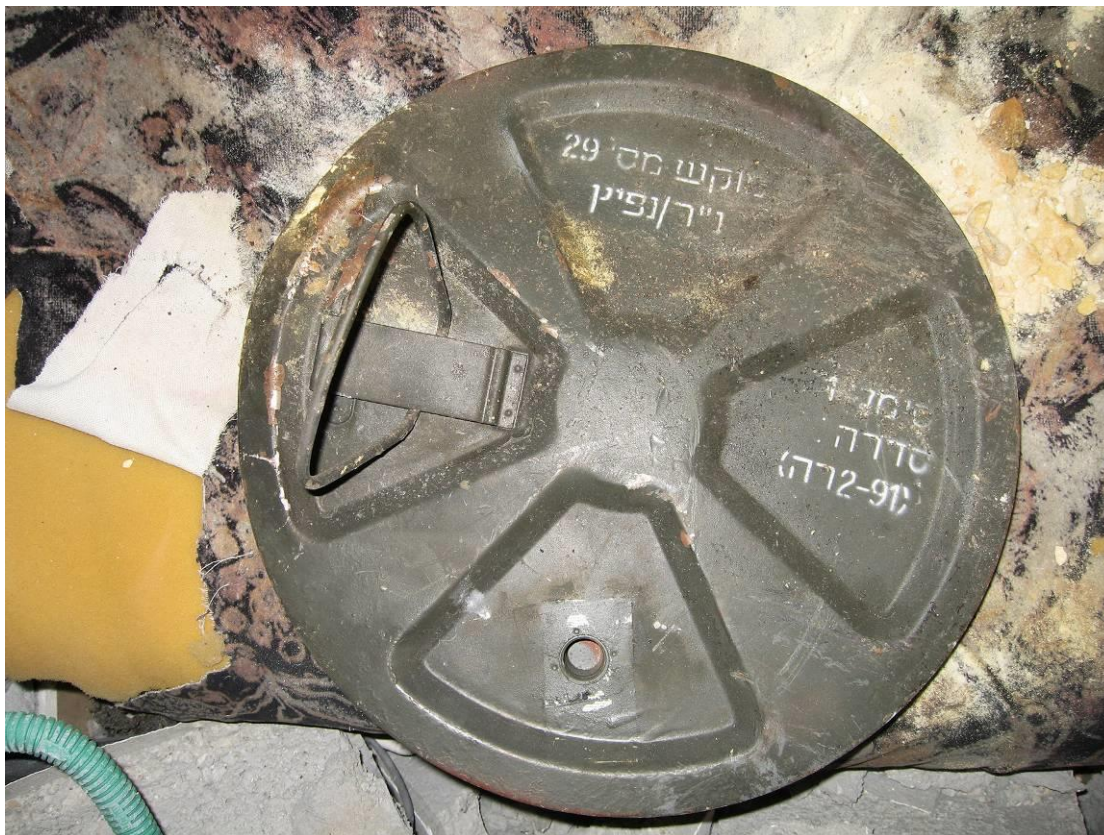
An Israeli anti-tank mine with Hebrew markings

On Wednesday 28 January, at the home of the Mardi family in Atatra, where 20 members of the family lived, Amnesty International delegates found one of the anti-tank mines that was used by Israeli soldiers to blow up the family's house on 4 January. The mine was damaged but had failed to explode. The family said that they had found another such mine, wholly unexploded, which had been removed by the local police. The mine, like others - exploded and unexploded - found by AI delegates in the rubble of other destroyed houses, bore Hebrew writing and serial numbers. Though designed for use against tanks, these mines are easily adapted to other purposes through the addition of an explosive charge and fuse. Israeli soldiers have previously confirmed to Amnesty International that these anti-tank mines have long been used to destroy Palestinian houses, most often in the West Bank but also in Gaza.