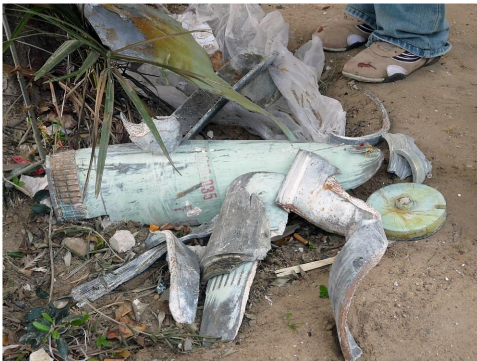
A white phosphorus carrier shell

Amnesty International found that the Israeli army used white phosphorus, a weapon with a highly incendiary effect, in densely-populated civilian residential areas in and around Gaza City, and in the north and south of the Gaza Strip. The organization's delegates found white phosphorus still burning in residential areas throughout Gaza days after the ceasefire came into effect on 18 January - that is, up to three weeks after the white phosphorus artillery shells had been fired by Israeli forces. Amnesty International considers that the repeated use of white phosphorus in this way in densely-populated civilian areas constitutes a form of indiscriminate attack, and amounts to a war crime. 3