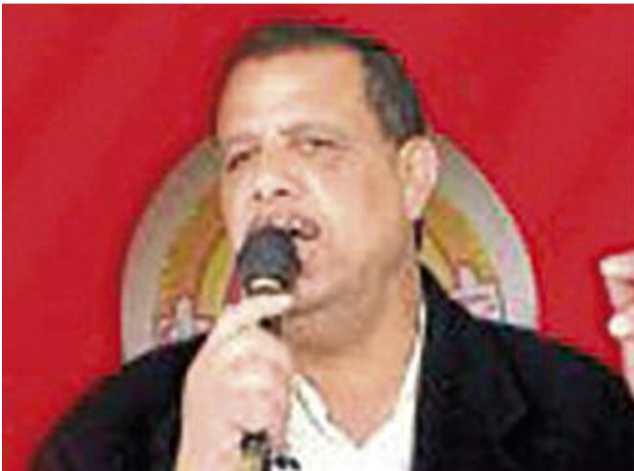
Right: Army reinforcements in Redeyef, June 2008