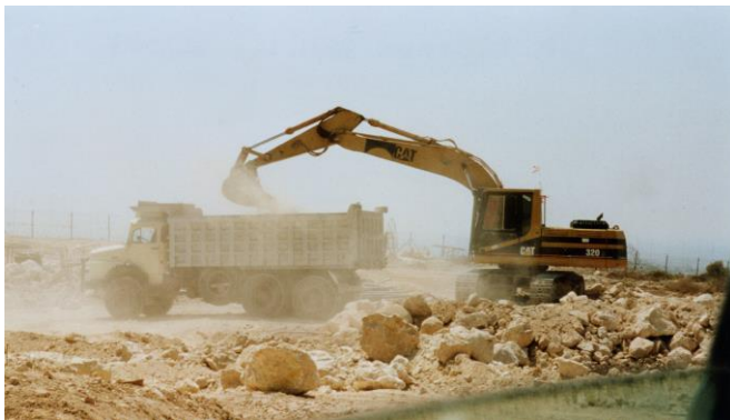
A US-made Caterpillar bulldozer is destroying land to build the fence/wall near Ras Atiya, West Bank .

depths. To date less than half of the route has been completed, mostly in the northern regions of the West Bank and around Jerusalem. In addition to the large areas of particularly fertile Palestinian farmland that have been destroyed, other larger areas have been cut off from the rest of the West Bank by the fence/wall. According to the Israeli authorities the fence/wall is intended to block entry into Israel to Palestinian suicide bombers and other potential attackers. However, the fence/wall is not being built between Israel and the Occupied Territories but