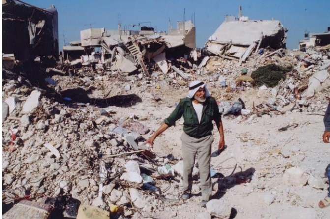
Man pointing at the rubble of his destroyed house in Jenin refugee camp, April 2002.

The largest single demolition operation carried out by the Israeli army was in Jenin refugee camp in April 2002. The army completely destroyed the al-Hawashin quarter, an area of 400 x 500 meters, and partially destroyed two additional quarters of the refugee camp, leaving more than 800 families, totaling some 4000 persons, homeless. 17 In the course of this and other Israeli army offensives there was considerable armed resistance by Palestinians, and the Israeli authorities claimed that the army destroyed the area in the course of combat with Palestinian gunmen.