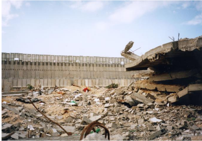
Destroyed houses in Khan Yunis refugee camp, near the Israeli settlement of Neve Dekalim (Gush Katif settlement bloc), in the Gaza Strip.

The Israeli army spokesperson's office issued different statements according to which the demolished houses: " served as cover for gunmen's fire ", " were suspected of serving as cover for tunnels used weapon in smuggling operations "; or were targeted " in response to the terrorist attack that killed an IDF officer and three soldiers. " 29