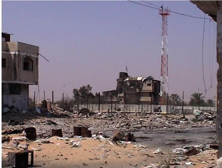
House demolition in Rafah refugee camp. © AI, July 2001

"the rhythm of shelter destruction in the Gaza Strip increased significantly" 23 and that UNRWA "was not able to keep up with the pace of shelter destruction" . 24