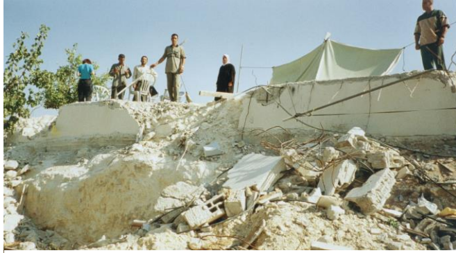
The house of the Shahadeh family in al-Walaja, West Bank, was destroyed for lack of a building permit. © AI, September 2003

At present the Israeli army continues to seize Palestinian land on grounds of “military/security needs” in order to build permanent structures to benefit the Israeli settlements in the Occupied Territories.