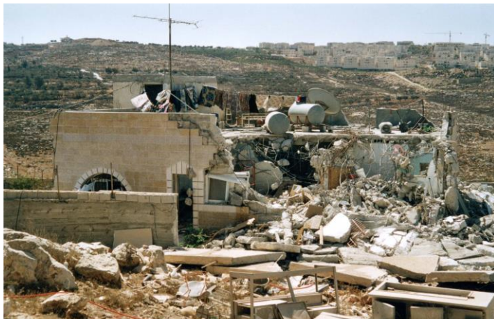
This house in Beit Hanina (East Jerusalem), home to the Badr family, was destroyed on 11 September 2001. The demolition reportedly stopped when the soldiers realised they were destroying the wrong house. In the background the Israeli settlement of Reches Shu'fat. © AI, September 2001

Since annexing East Jerusalem Israel has severely limited new construction in the Palestinian neighbourhoods. The expropriation of large areas of land near Palestinian neighbourhoods and villages left most Palestinian neighbourhoods with little or no land on which to build, and where there is land it is not permitted to build on it. Whereas in the rest of the West Bank the Israeli authorities have cited ancient plans which give no opportunity for development, in East Jerusalem they have done the opposite. Shortly after annexation in 1967