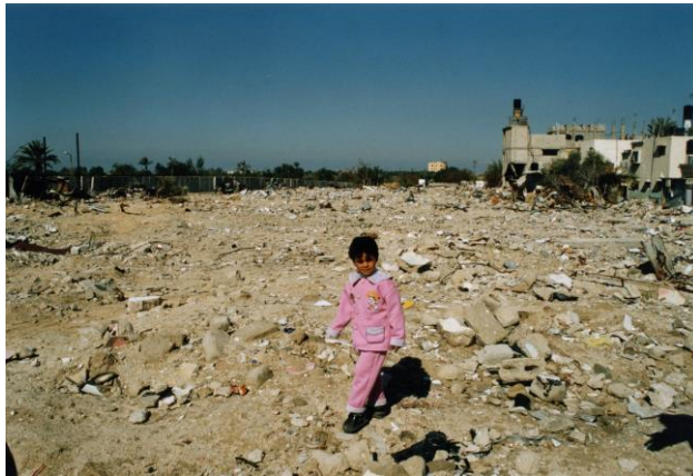
House demolition in Rafah, near the border with Egypt. February 2002

The already poor sewage system was further damaged by the Israeli army tanks and bulldozers, along with water mains and electricity and telephone lines. The Israeli army stated that during the operation it had uncovered three tunnels used by Palestinian armed groups to smuggle weapons from Egypt to the Gaza Strip. 25 In the preceding six weeks some 50 other houses were also demolished in Rafah, leaving hundreds more Palestinians homeless.