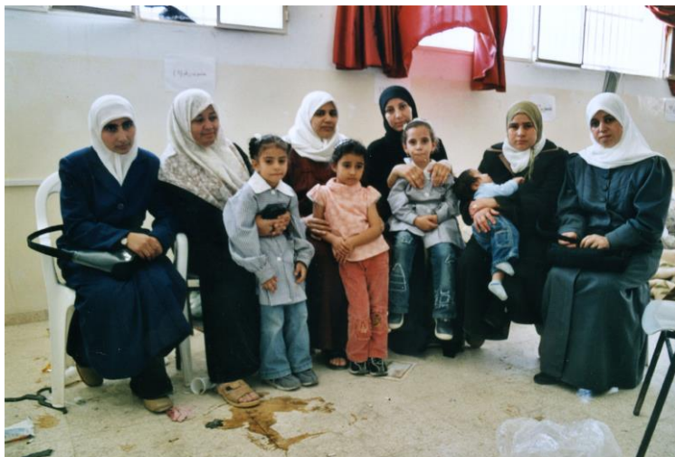
These women and children were made homeless when the Israeli army destroyed a seven-storey apartment building in Nablus on 5 September 2003. After the destruction they had to move in with relatives.

so after dark; how can we know who comes in and out of the building? It was a big building. We had saved for 14 years to buy this apartment; it was fully equipped and we had lived in it less than a year. Now we have nothing, all our furniture, clothes, documents, money, the children's school bags, our photographs, everything got buried in the rubble. The children have been traumatized by what happened, they saw their home destroyed, and every day they see the rubble of their home and don't have a