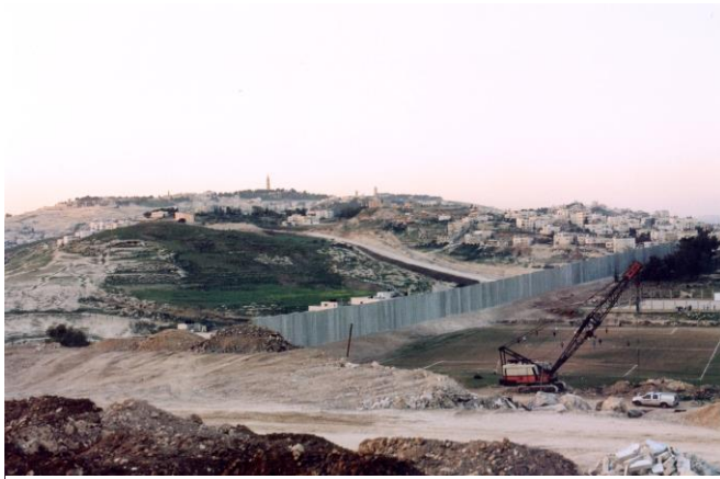
Construction of the concrete wall in Abu Dis, East Jerusalem, March 2004.

Since the summer of 2002 the Israeli army has been destroying large areas of Palestinian agricultural land, as well as other properties, to make way for a fence/wall which it is building in the West Bank. The fence/wall is planned to run for some 650 kilometers, most of it through the West Bank, from north to south. 19 It has an average width of 60 to 80 meters, including barbed wire, ditches, large trace paths and tank patrol lanes on each sides of the fence/wall, as well as additional buffer zones/no-go areas of varying