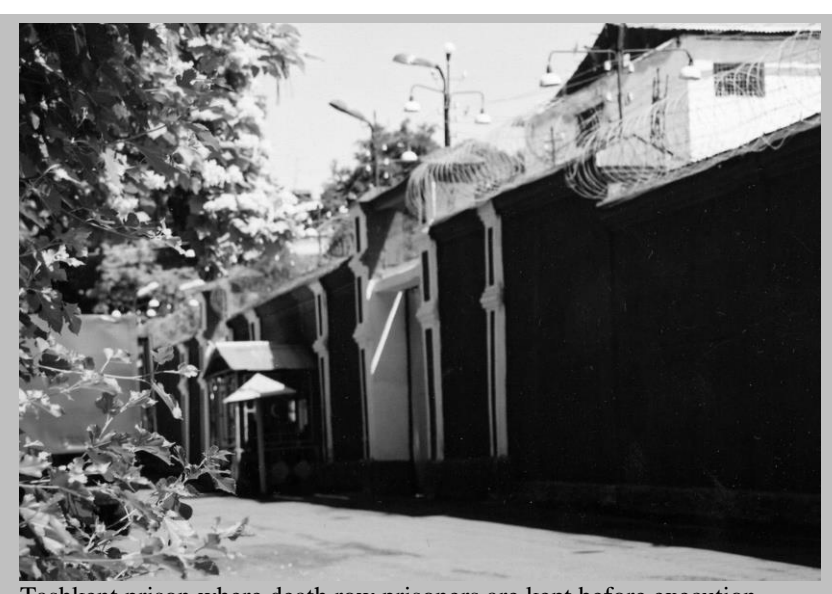
Tashkent prison where death row prisoners are kept before execution.

International in June 2003 that cells built in the Soviet era measure 4m<sup>2</sup> and those built later 6m<sup>2</sup>. He said that death row prisoners were usually kept in a cell of their own but, if they wished, could share a cell