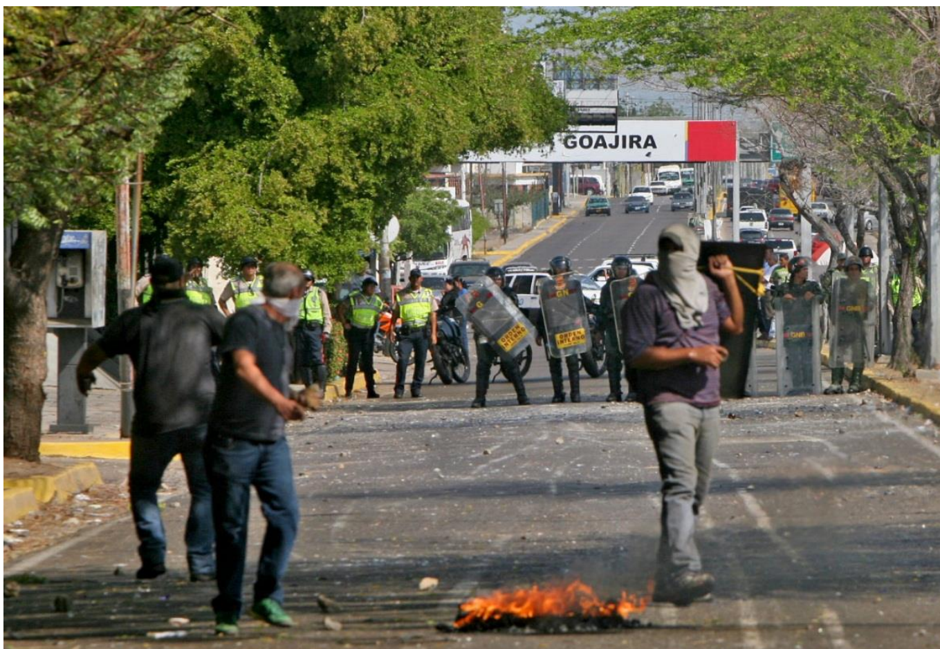
Bottom: Protests in Zulia state, March 2014