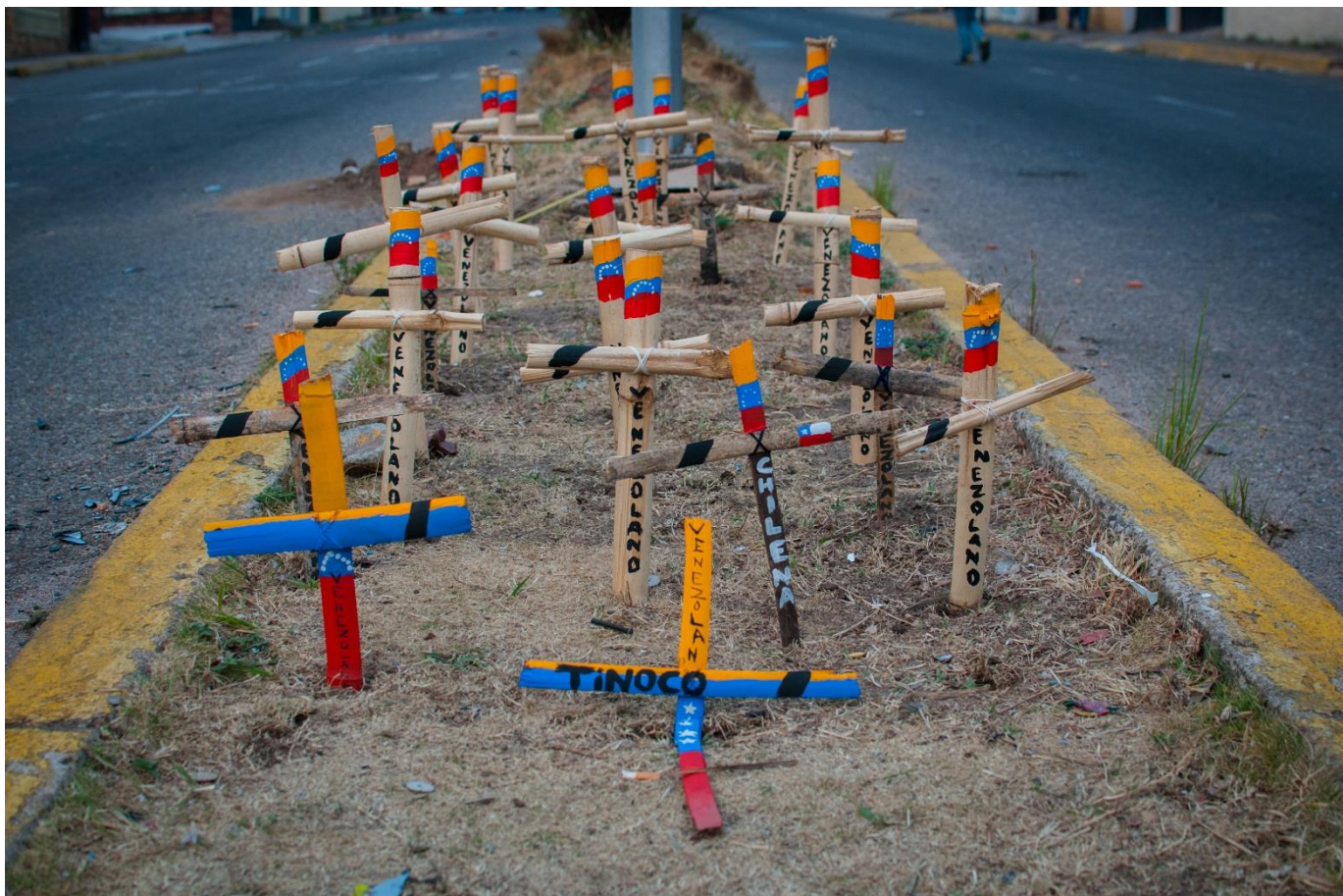
Top: a series of crosses representing those who have died since the beginning of the protests, Táchira state, March 2014