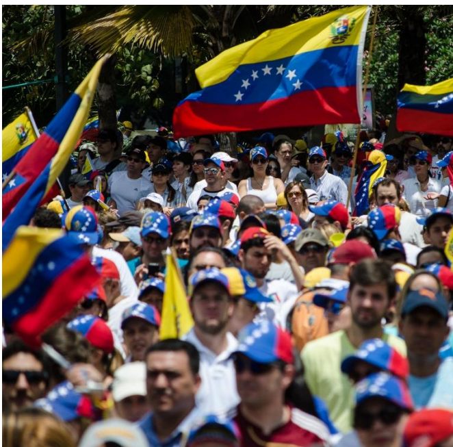
Bottom right: Pro government demonstration, 22 March 2014