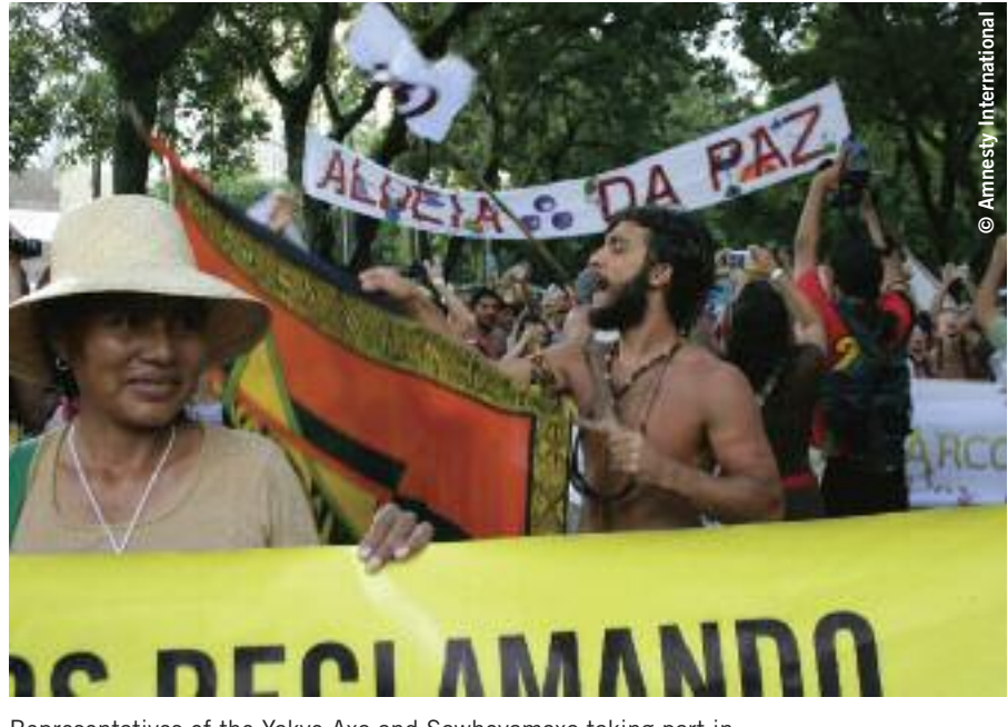
Representatives of the Yakye Axa and Sawhoyamaxa taking part in the World Social Forum, Belém, Brazil, February 2009.