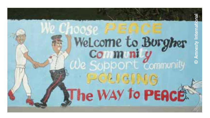
Mural at the Eastern Peace Centre in the community of Burgher in east Kingston, 14 October 2007.

Political leaders acknowledge that consecutive governments actively helped create the environment in which gang violence could flourish. Gang control is at its most pervasive in communities entirely under the control of one or other of the political parties ("garrison communities").