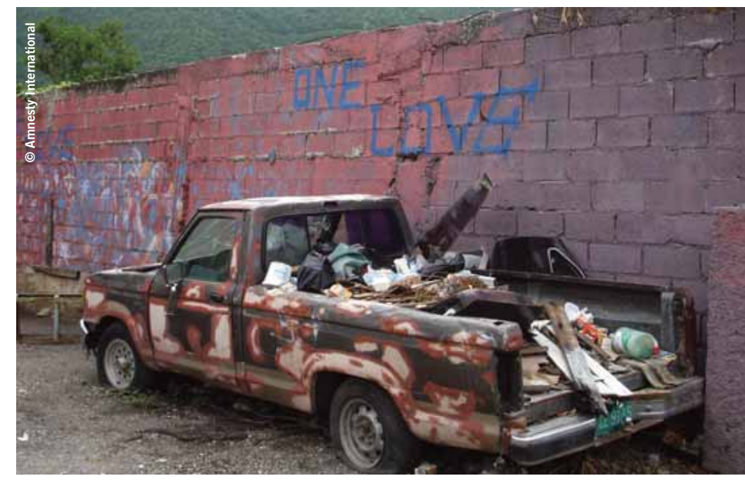
Burned out truck in inner city community, Kingston, October 2007.

this crisis, through the creation and perpetuation of a political system that relies on gang leaders to gain electoral support, corruption and tolerance of organized crime. They need to be held to account. Victims experiencing human rights violations in Jamaica's inner cities cannot wait any longer.