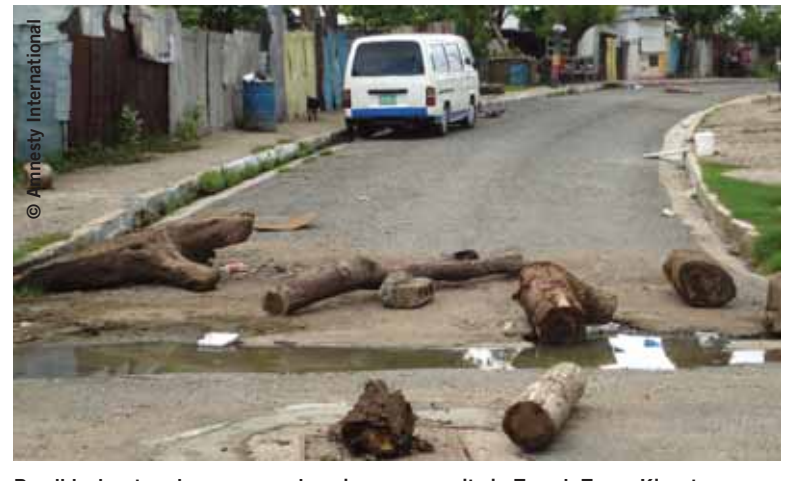
Roadblock set up by gang members in a community in Trench Town, Kingston, 14 October 2007.