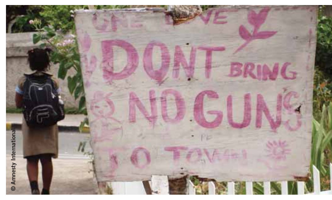
Hand-painted sign on a street in an inner-city community in Kingston, 4 October 2007.

Woman from inner-city community, Kingston, October 2007