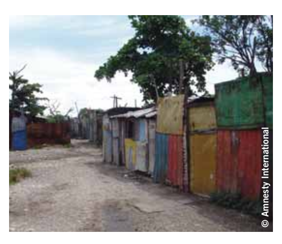
Inner-city community of Majesty Gardens, Kingston, 2 October 2007. Many homes in inner-city communities lack basic facilities such as running drinking water and a sewage system.

Mr Thomas, Grants Pen, Kingston, October 2007