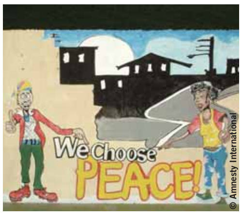
Mural in August Town, Kingston, 3 October 2007.

Amnesty International also calls on other governments to support and promote the creation and implementation of the public security plan