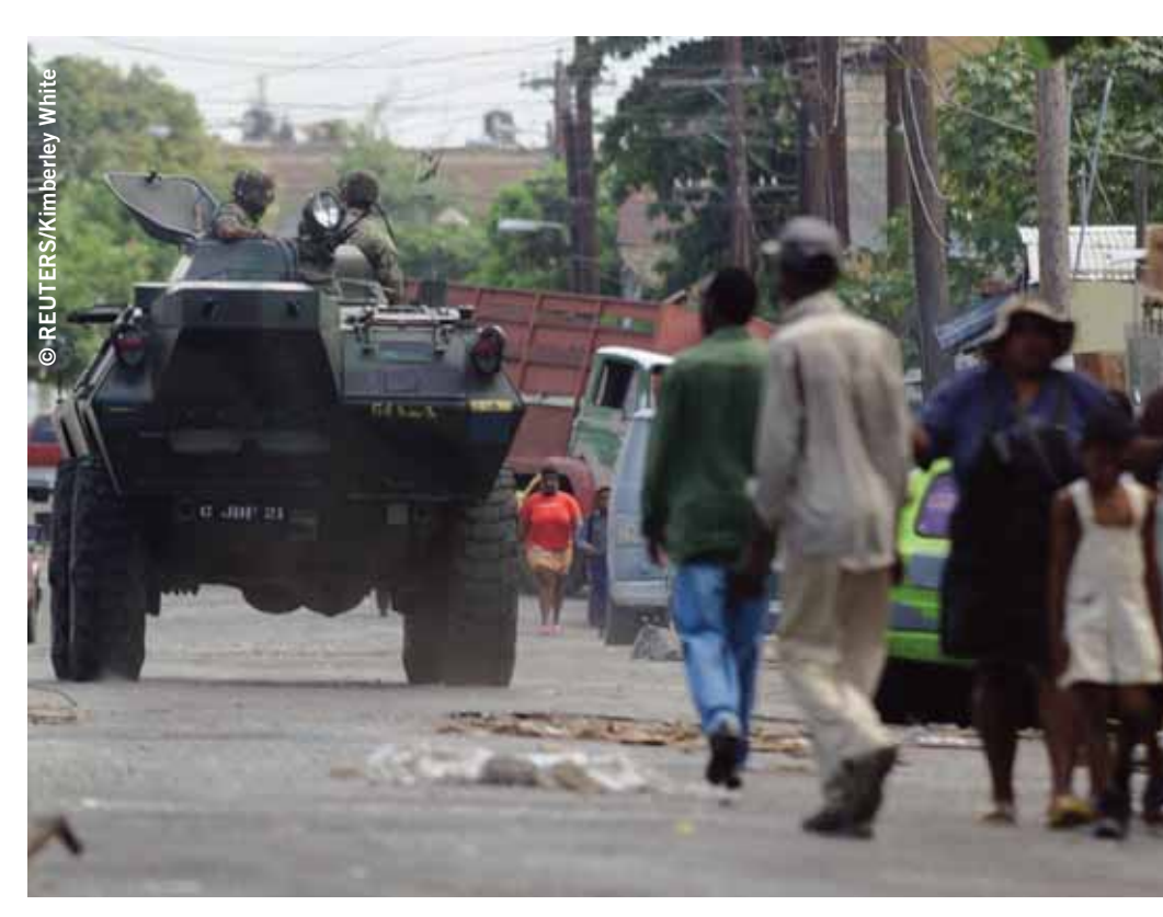
Armoured vehicle patrolling a neighbourhood in Kingston, July 2001.

There are persistent reports of discrimination and killings by the security forces. In many cases, these killings may have resulted from the legitimate use of force. However, in those cases where there was strong evidence that they were fatal shootings, even extrajudicial executions, the victims' families