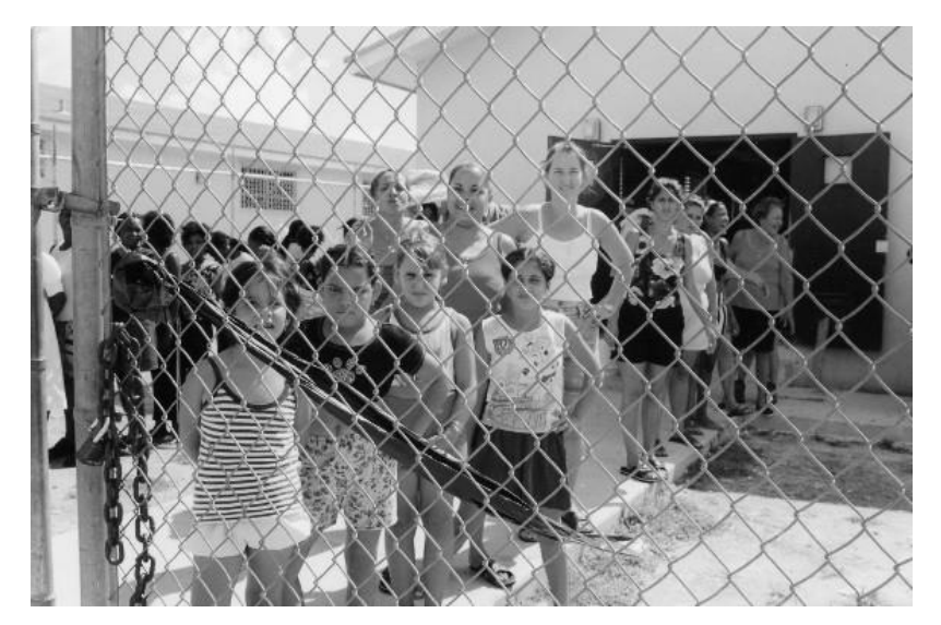
Children detained alongside female detainees line up for roll call @Amnesty International.

Amnesty International is seriously concerned about the treatment of children detained in the Carmichael Detention Centre. In the organisation's view, their conditions of detention amount to cruel, inhuman and degrading treatment and places the Bahamas in serious breach of the UN Convention on the Rights of the Child. Amnesty International is calling for urgent measures to be taken to improve this situation.