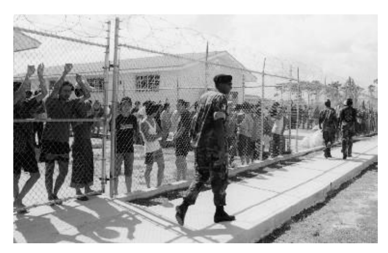
Soldiers patrol the inside of the Carmichael Detention Centre

Amnesty International is very concerned at reports that some detainees at the Carmichael Detention Centre have allegedly been victims of physical or, in some cases, sexual abuse whilst in detention. Amnesty International interviewed detainees extensively at the centre and believes that the reports received are credible. Reports of ill-treatment were brought to the attention of the authorities who thus far have failed to respond to requests for information on investigations.