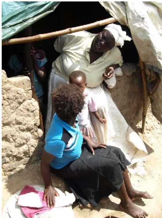
Women and a child. The nearest clinic providing health care for pregnant women and newborn babies is 8 kilometres away, June 2010, © Amnesty International

Inability to access transport is a contributing factor to the large numbers of home deliveries without skilled birth attendants at Hopley settlement. Transport is not available at night. Women and community leaders told Amnesty International that private ambulances and transporters refuse to go to Hopley settlement after dark citing security concerns.