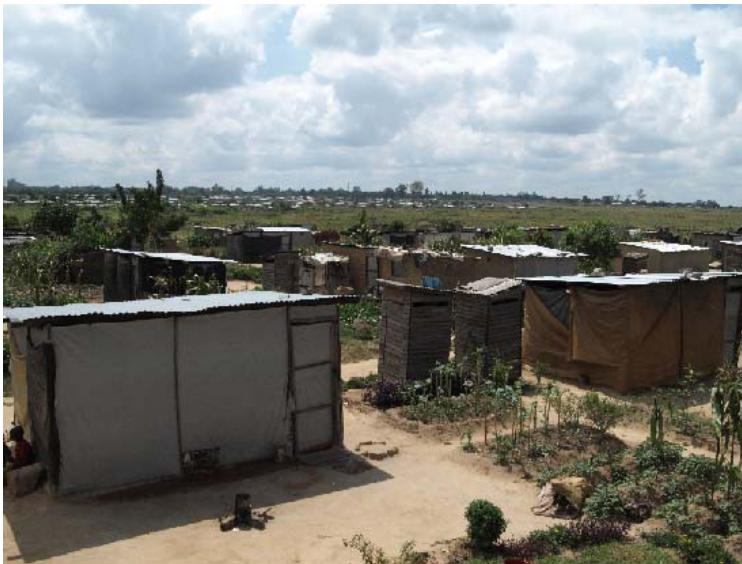
Most families who were moved to the Hopley settlement live in plastic shacks with little protection from the elements, June 2010, © Amnesty International

Most people generally cannot afford healthcare fees in Zimbabwe. According to the 2005-2006 Zimbabwe Demographic and Health Survey – the latest such survey available – some 58% of Zimbabwean women were unable to access healthcare because they did not have money to pay for treatment. 10 Lack of access to healthcare because of inability to raise funds for treatment rises to 75% for women in the lowest of five wealth groups, 11 the group to which women living at Hopley and other Operation Garikai settlements are likely to belong.