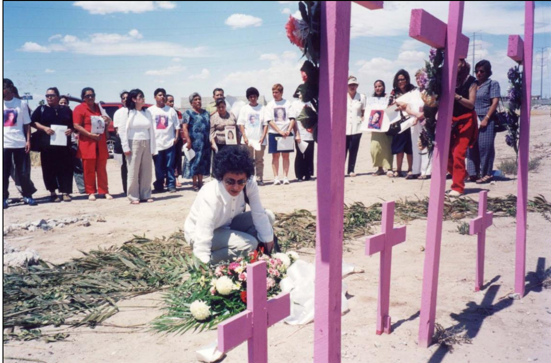
Irene Khan at memorial site c. AI

External December 2003 AI Index: ACT 60/009/2003