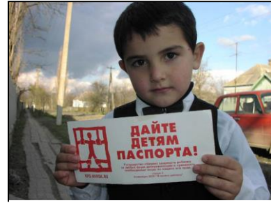
Young boy with 'Give Kids Passports' banner c. School of Peace

Throughout the campaign, AI members have worked to focus international attention on patterns of injustice and to encourage the Russian authorities to abide by their international obligations. AI's action focused on three key areas: human rights violations against ethnic and national minorities; violence against women; and children's rights. The ongoing conflict in Chechnya also proved to be another focal point for campaigning and lobbying.