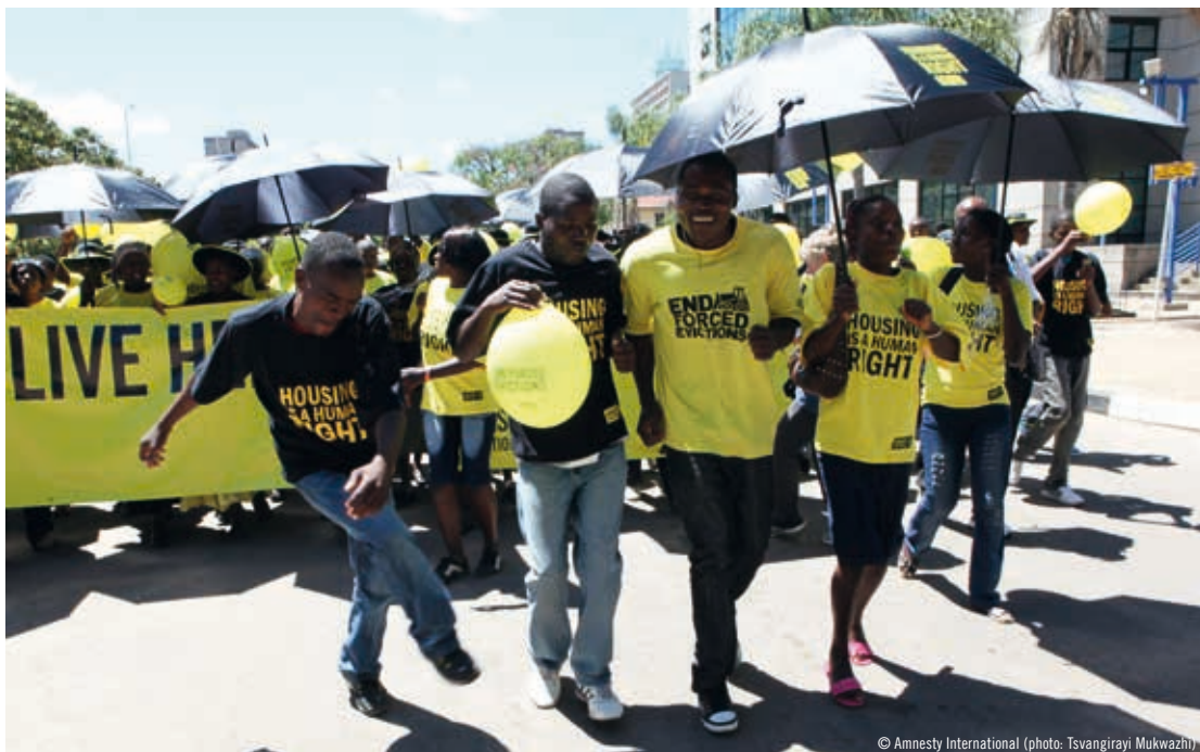
© Amnesty International (photo: Tsvangirayi Mukwazhi)