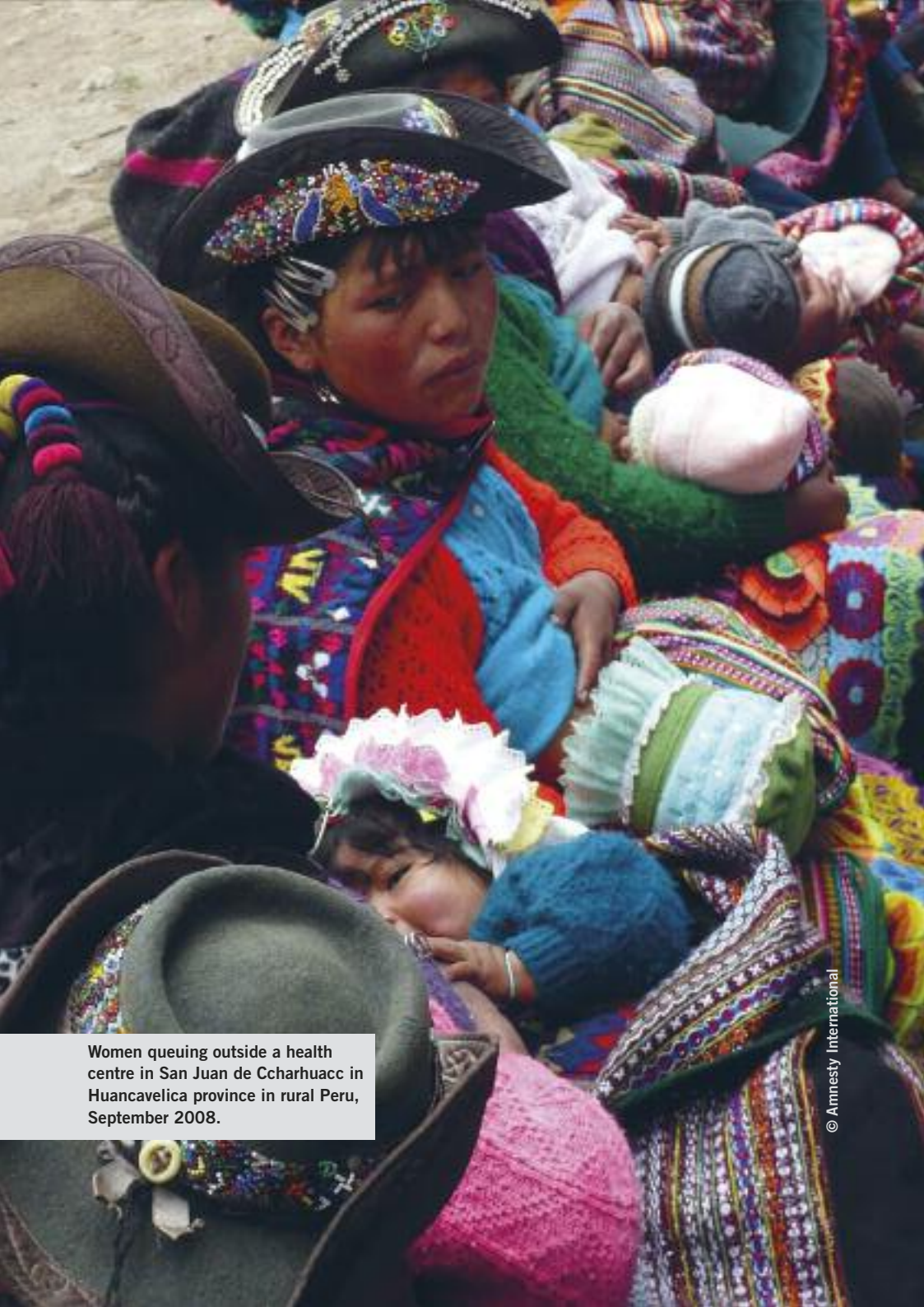
Women queuing outside a health centre in San Juan de Ccharhuacc in Huancavelica province in rural Peru, September 2008.