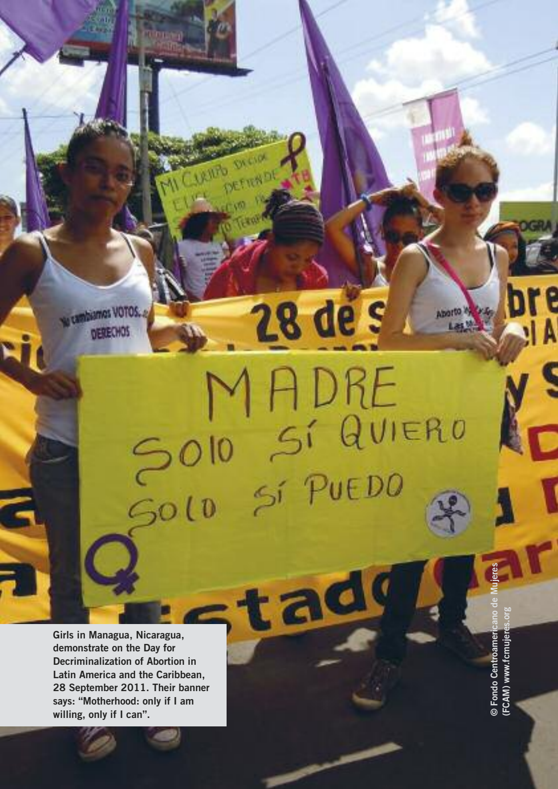
Girls in Managua, Nicaragua, demonstrate on the Day for Decriminalization of Abortion in Latin America and the Caribbean, 28 September 2011. Their banner says: "Motherhood: only if I am willing, only if I can".