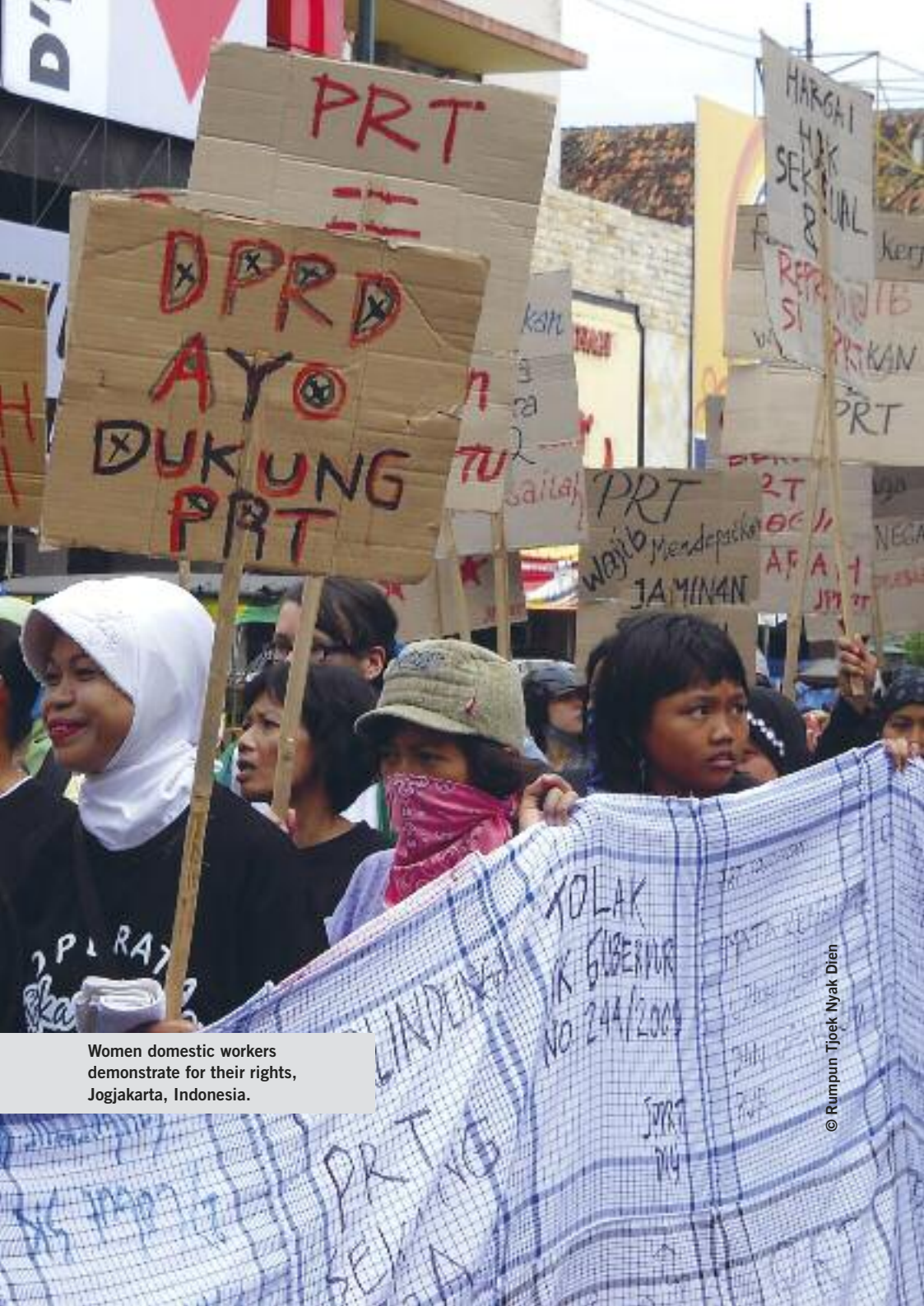
Women domestic workers demonstrate for their rights, Jogjakarta, Indonesia.