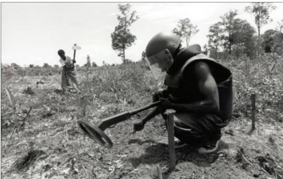
A woman in Angola prepares land for planting while a de-miner continues his clearance work