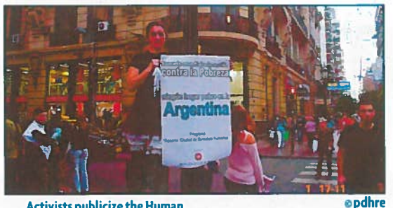
Activists publicize the Human Rights City in the main street in Rosario, Argentina.

As educators we have several choices: on the one hand, whether to school people in human rights, or on the other to have our students discover through dialogue and learning the true meaning of human rights for their future. Is it not the case that simply rehearsing articles, norms and standards and focusing only on violations has the effect of compartmentalizing the vertical aspects of human rights? Rather, should we not enable our students to imagine human rights as the road they must take to overcome violations if long-term social transformation is to be pursued? (As I often say: human rights are the banks of the river in which life can flow freely. And when the floods come, HRE and learning strengthen these banks.)