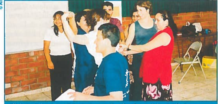
All photos: Delegates participating in a popular education workshop in Alforja, El Salvador, in September 2003.

As in all education, PE has and accepts an ethical option. We identify PE with "the ethics of life". Consequently, we reject and distance PE from "the ethics of the market", which are dominant and hegemonic, and produce human beings