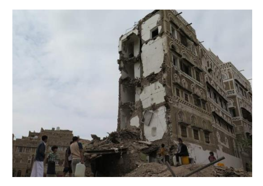
A coalition strike in Sana'a Old City, destroyed four adjacent houses on 12 June 2015 killing five members of the Abdelqader family ©Amnesty International.

The Saudi Arabia-led coalition spokesman Brigadier-General Ahmed al-'Assiri denied responsibility for the strike but a fragment of the bomb recovered from the rubble of the houses shows that it comes from a 2,000 lb (900 kg) bomb, the same type which has been widely used by the coalition in various parts of Yemen.