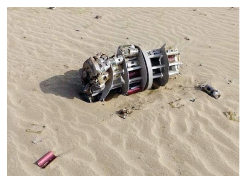
The remains of the body of a UK-manufactured BL-755 cluster bomb in Hajjah in northern Yemen

Amnesty International's research team located the BL-755 bomb in Hayran in the centre YEMAC was using to store unexploded ordnance they had collected. The bomb had malfunctioned and bomblets in five of the original seven sections had neither dispersed nor detonated as designed. Around a dozen bomblets were still inside in the crushed remains of the bomb casing and YEMAC had stored another 70 or so bomblets in the same facility indicating that 80 or so bomblets, more than half, failed to detonate.