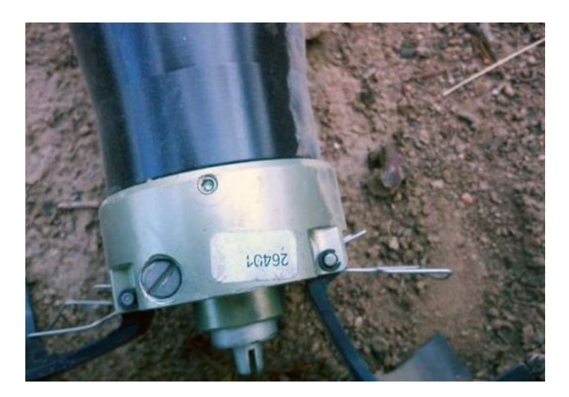
Unexploded submunitions pictured at the attack site bear similarities to Brazilian-manufactured cluster bombs Saudi Arabia is known to have used in the past. The attack was on a residential neighbourhood in Ahma, Sa'da, Northern Yemen on 27 October 2015.

Even though Brazil, Yemen, Saudi Arabia and the other members of the Saudi Arabia-led coalition participating in the conflict in Yemen are not parties to the Convention, under the rules of customary international humanitarian law they must not use inherently indiscriminate weapons, which invariably pose a threat to civilians.