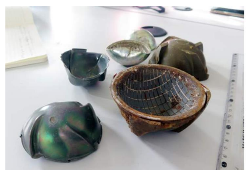
Remnants of cluster bomb submunitions at the Yemen Executive Mine Action Center (YEMAC) in Sa'da.

"[Different] types of cluster munitions have been used [by the coalition] but we have only worked with four of the types before. We were surprised by the new kind. They are more sensitive... It is difficult to get explosives to detonate the bombs but storing them is dangerous" he said. "We need to bring in trainers from the countries that made the weapons to train the employees...[and] we are looking for better technology to destroy these bombs."