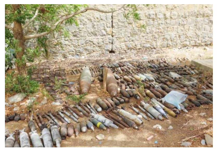
Explosive Remnants of War in the garden of the Yemen Executive Mine Action Center (YEMAC) in Hayran

While the full extent of cluster munition contamination is not yet known, in the first three weeks of their work, YEMAC records show its teams working in Sa'da and Hajjah governorates cleared at least 418 cluster bomb submunitions, 810 fuses and artillery remnants, 51 mortars and more than 70 missiles.