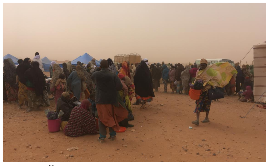
(\odot) \uparrow Agadez, Niger. Reception camp for Nigerien nationals expelled by Algeria

• The authorities violated existing legal provisions and the procedural safeguards set out in the Convention on migrant workers and in national law on expulsion, including the absence of any formal notification of the expulsion decision, access to lawyers, the effective right to a suspensive appeal and oversight of the legality of the procedure, and the refusal to allow the persons concerned to receive consular assistance. Non-Nigerien Sub-Saharan migrants were often abandoned in desert areas at the Algerian-Nigerien border and were forced to cross the border walking. Amnesty International has reviewed satellite imagery of the border and videos transferred by migrants, documenting the crossing, that confirm the dynamics of the expulsions. The temperature at the desert border area can reach up to 45 degrees and exposes people to dehydration.