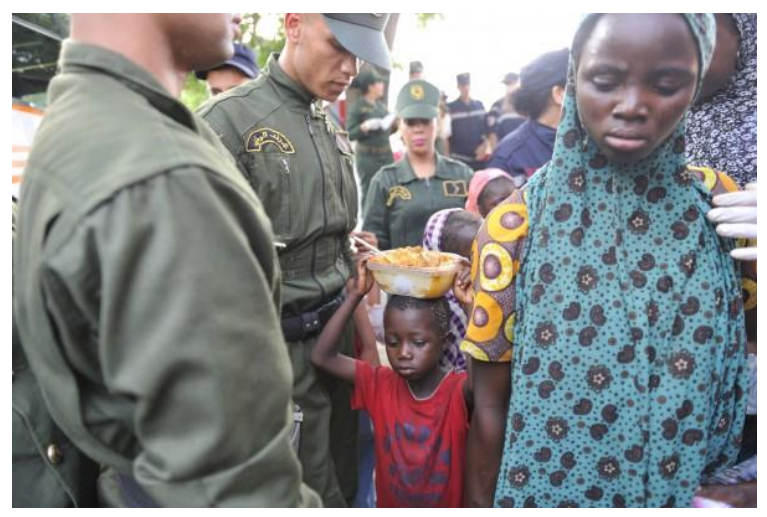
O \uparrow Young woman and children from Niger held in Zeralda camp, Algiers O Louiza Ammi/Liberté

The security forces have held migrants and refugees arrested in Algiers in Zeralda camp, a facility previously used for tourism camps and run by the Algerian Red Crescent, converted into an informal detention centre for migrants before their forcible deportation to the far south. Migrants and refugees arrested in Oran were taken to a facility in Bir El Djir, few kilometres east from Oran, run by the Algerian Red policed Crescent and bv gendarmes. The authorities usually held migrants - children. women and men all together - for one to three days in the camp before being deported, and made them sleep on the floor, providing them with insufficient water and food provisions.