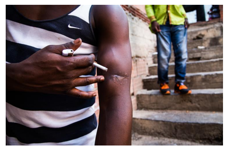
Knife wound suffered by A. during a fight with his Algerian neighbours

In parallel, the situation of migrants in the country was at the heart of an intense political debate in Algeria. On the one hand. Prime Minister Tebboune - appointed after legislative elections in May 2017 - announced his commitment to grant to Sub-Saharan migrants appropriate reception and to issue residency cards to refugees in the country in order to recognise their right to work.<sup>3</sup> Minister of Internal Affairs Noureddine Bedoui has publicly recognized that the country requires foreign workers in the labour force, particularly in construction, and announced a project to regularise the status of undocumented migrant workers.<sup>4</sup>