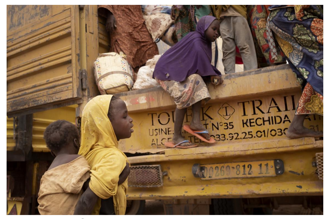
(\odot) \uparrow Young children from Niger forcibly transported back to Niger \odot Francesco Bellina

Nonetheless, following the bilateral repatriation agreement, the Algerian authorities carried out mass arrests and expulsions to Niger of thousands of undocumented Nigerien migrants, targeting first women and children and over time also Nigerien male migrant workers. In 2016, the Algerian authorities expanded the scope of these activities to include migrants, asylum seekers and refugees from other western African countries in addition to Niger - including Mali, Guinea Conakry and Cameroon - forcibly transporting them towards the southern borders of the country. In December 2016, security forces arrested an estimated 1,500 Sub-Saharan African migrants and refugees in Algiers, and arbitrarily expelled hundreds of them to neighbouring Niger within days without individual assessment and legal procedures.1 At least seven registered asylum-seekers from the Democratic Republic of the Congo were expelled as part of this group. These expulsions happened after clashes between local residents and migrants from Sub-Saharan Africa occurred in Algiers.