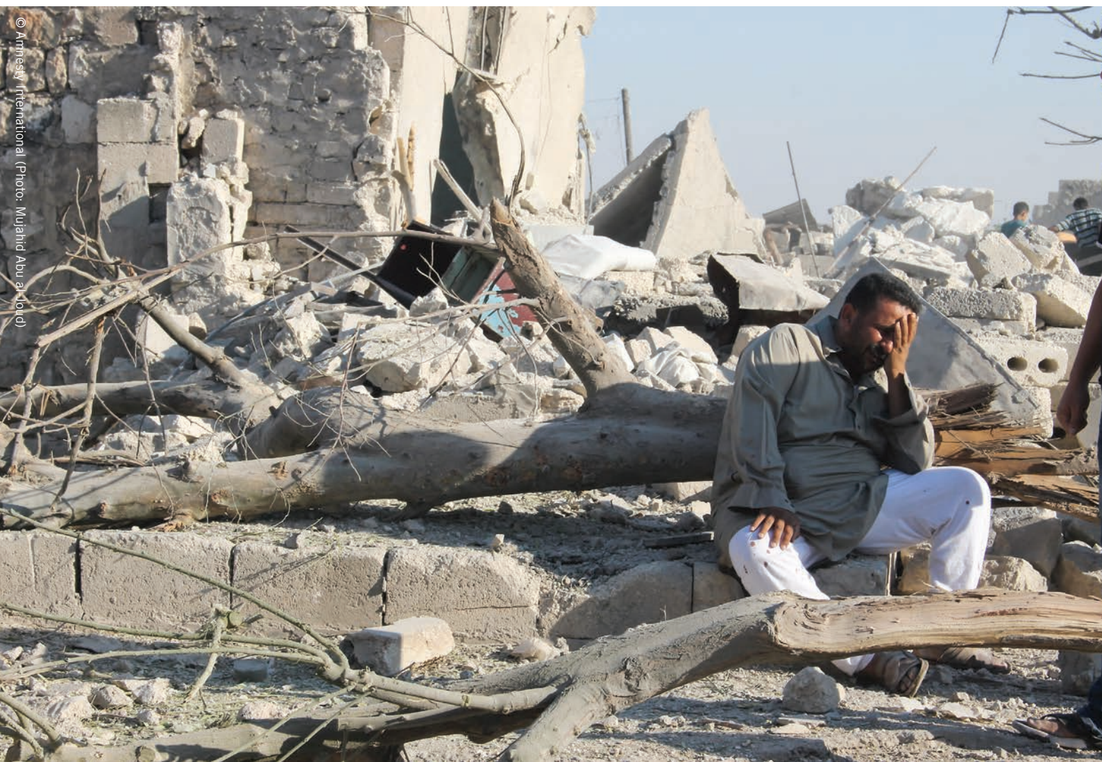
Survivor of an air strike on Ma'adi neighbourhood, 11 July 2014.