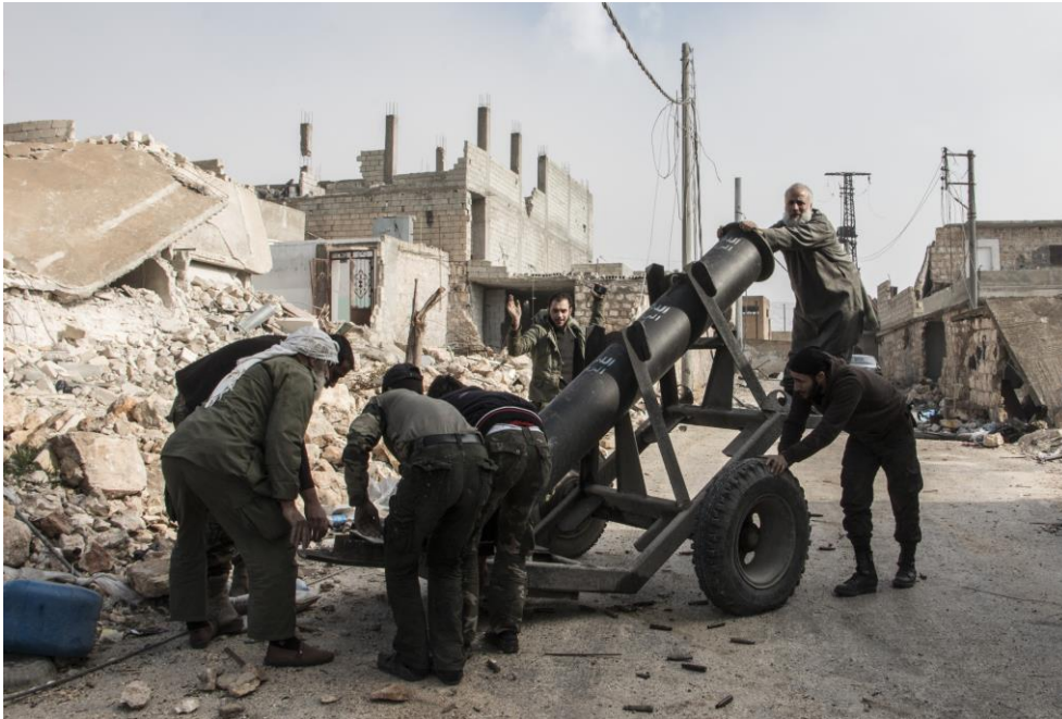
A group of armed opposition fighters preparing a "hell cannon", which was made locally. Opposition fighters in Aleppo have created their own rockets and their own launchers. 22 November 2014

The "hell cannon" is an improvised explosive device (IED) reported to have been first built by the armed opposition group Ahrar al-Shamal in 2013. The cannon barrel is usually around three feet long and mounted on wheels. The projectile is a re-purposed propane gas canister, which is filled with explosives and shrapnel. The typical hell cannon can fire more than 15 types of shells that weigh more than 40 kilograms and has a range of 1.5 kilometres. The hell cannon is just one of a variety of IEDs that have been developed by armed opposition groups during the conflict in Syria. It continues to be a popular choice with armed opposition forces and dozens of videos showing it in action have been posted online. 107