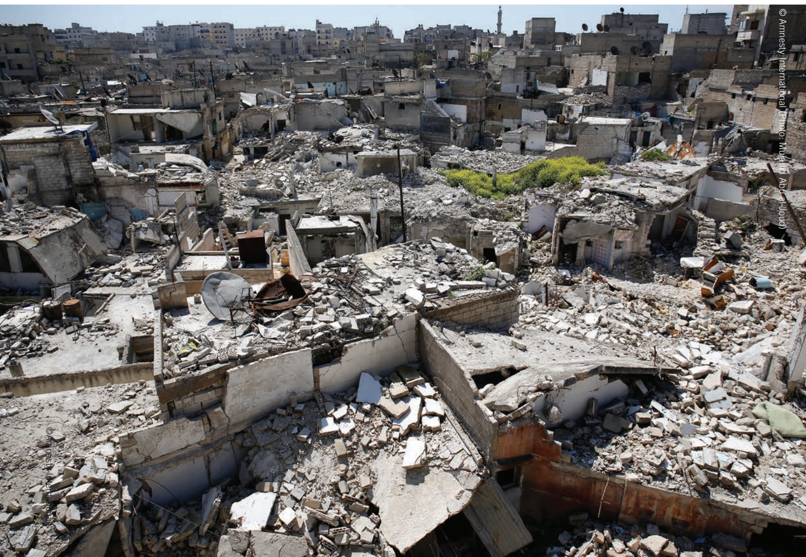
Bustan al-Qasr neighbourhood, 6 April 2015. The green area in the photo marks a fruit and vegetable market that still operates amid the destruction.