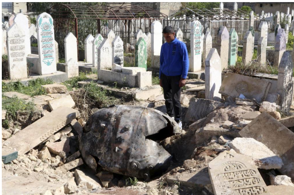
A man looks down at an unexploded barrel bomb dropped by forces loyal to Syria's President Bashar al-Assad at a cemetery in the al-Qatanah neighbourhood of Aleppo. 27 March 2014

According to the Syrian Network for Human Rights, 12,194 people were killed in Syria from 2012 until February 2015 as a result of barrel bomb attacks by government forces. Only 473 of these people were fighters, meaning that 96% of this total were civilians. More than half were killed after the adoption of UN Security Council Resolution 2139. As of February 2015, of all governorates in Syria, Aleppo suffered the greatest number of victims from barrel bomb attacks. According to the Violations Documentation Center, 3,124 civilians – and only 35 fighters – were killed in barrel bomb attacks from January 2014 to March 2015 in Aleppo governorate. Local monitors told Amnesty International that the large number of civilian casualties is likely due to the fact that barrel bombs are so imprecise that the government rarely drops them near the front line, where they might hit their own forces. Instead, barrel bombs have struck apartment buildings and populated areas such as public markets, transportation hubs and mosques.