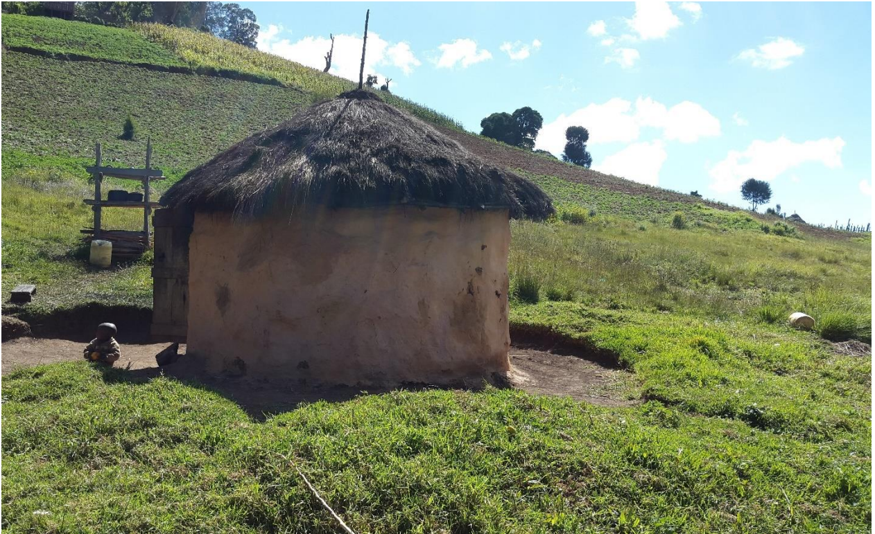
Former potato store, now housing evicted Sengwer family of 5, outside forest, 2017.