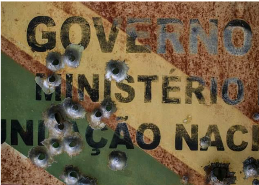
A sign from Brazil's National Indian Foundation (FUNAI) declaring the Uru-Eu-Wau-Wau territory (in Rondônia state, Brazil) "Protected Land" was shot following an intrusion in January 2019.