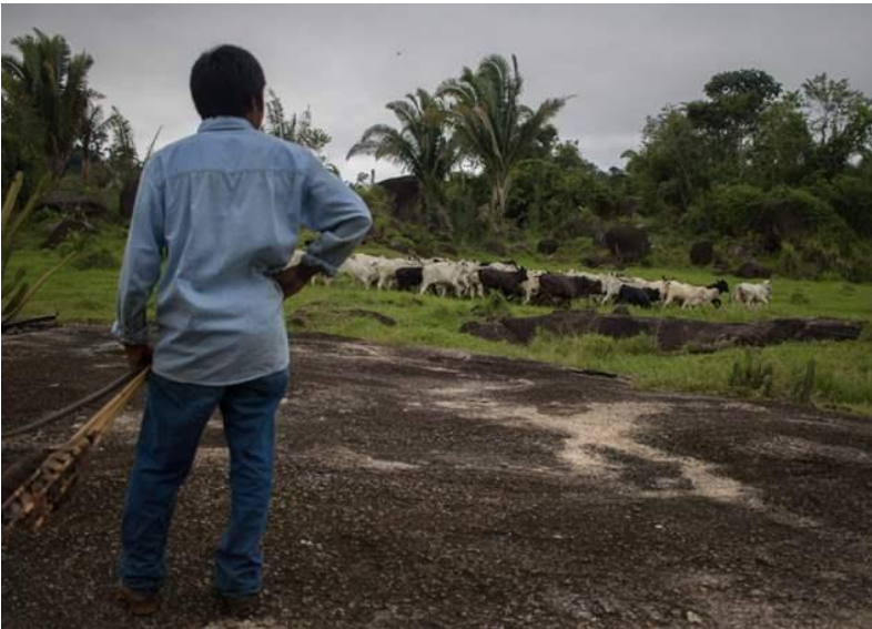
An Indigenous man observes cattle near Uru-Eu-Wau-Wau territory in Rondônia state, Brazil, 2019. Cattle ranching is one of the major drivers of deforestation in Brazil's Amazon.