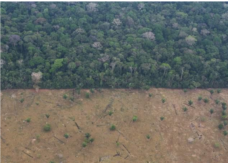
A boundary of Uru-Eu-Wau-Wau territory in Rondônia state, Brazil. The legal recognition of Indigenous territories can play a protective role against deforestation.