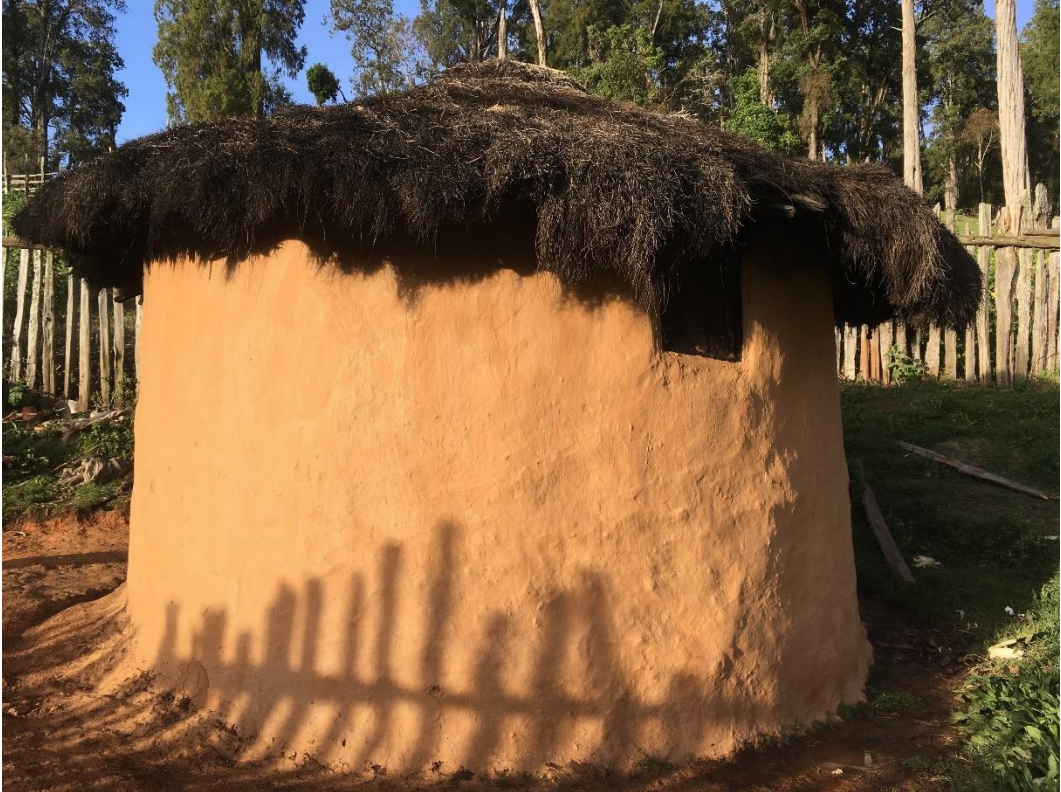
A traditional Sengwer hut in Embobut Forest