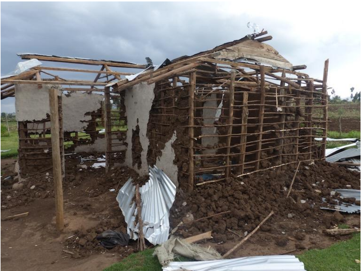
An Ogiek family's house inside the Mau Forest Complex. Police officers and civilians allegedly destroyed it during evictions of Ogiek from the forest.