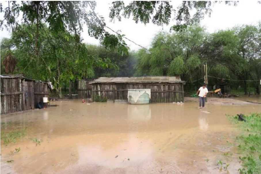
Photos: Yakya Axa community after floods, March 2019