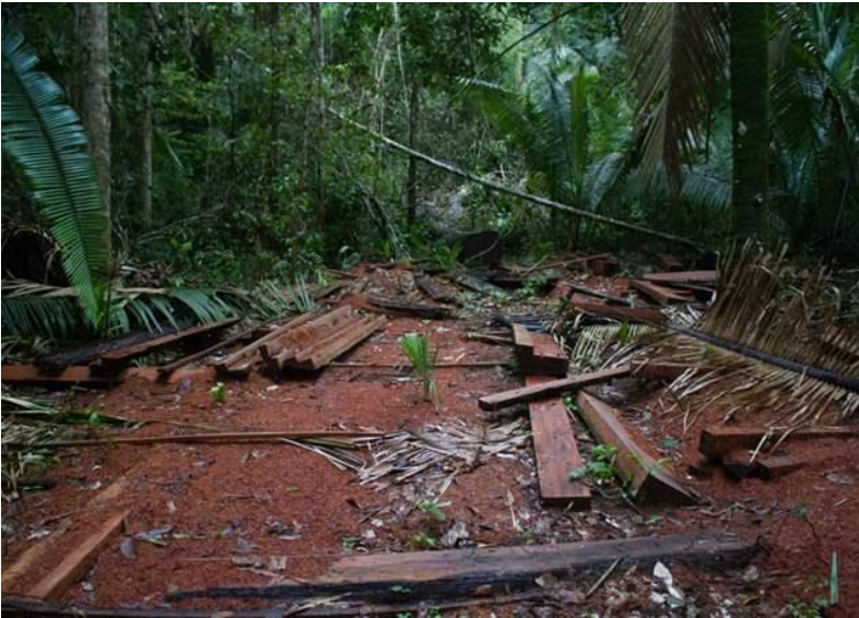
Illegally logged timber in Uru-Eu-Wau-Wau territory in Rondônia state, Brazil, 2019.