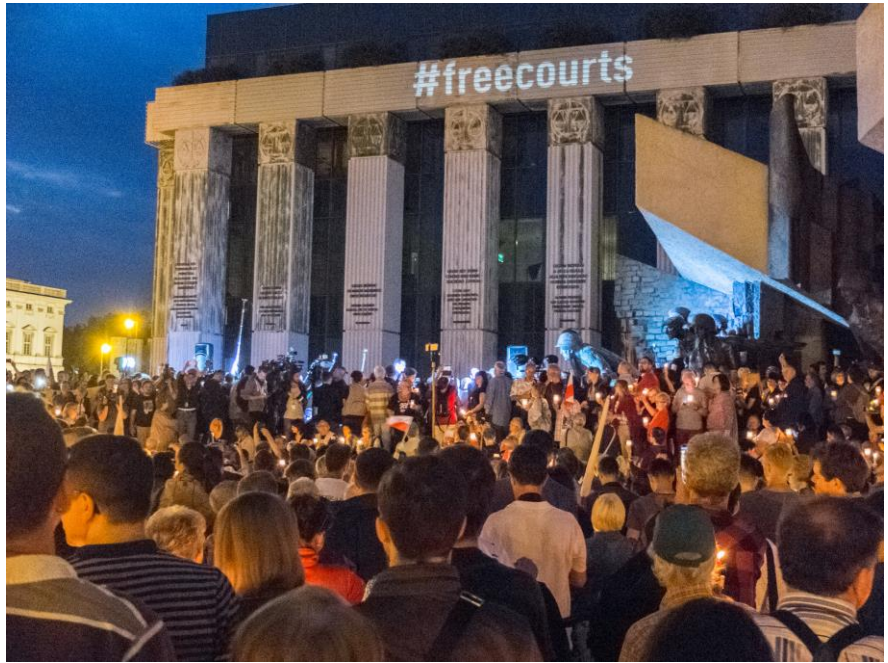
Protest in front of the Supreme Court on 16 July 2017 in Warsaw.

In early hours of 26 April 2019, MPs adopted another amendment to the Law on the Supreme Court. This amendment provides for the discontinuation of the appeal of the three Supreme Court judges who were forced to retire under the previous amendment to the Law on the Supreme Court.<sup>161</sup>