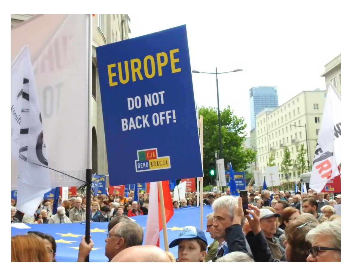
Assembly in front of the European Commission Representation Office in Poland on 25 June 2018, calling on Europe to continue to urge Poland to uphold the rule of law.

Article 19(1) of the Treaty on European Union, read in connection with Article 47 of the Charter of Fundamental Rights of the European Union, requires that member states, including Poland, guarantee the right to an effective remedy before an independent and impartial court. The new disciplinary proceedings characterized by extensive powers of the Minister of Justice, and the special position of the Disciplinary Chamber of the Supreme Court, <sup>173</sup> led the European Commission to a conclusion in April 2019 that Poland does not comply with the EU law. Specifically, the EC considered that the Disciplinary Chamber of the Supreme Court is not an independent body. <sup>174</sup>