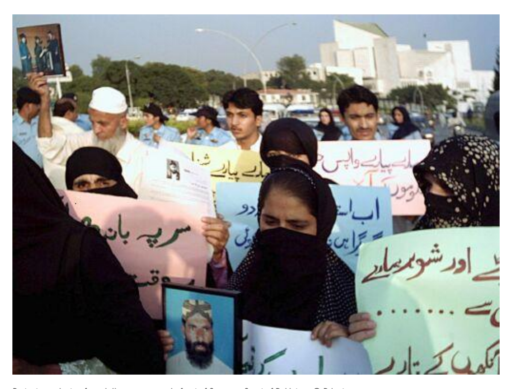
Protests against enforced disappearances in front of Supreme Court of Pakistan.

Official Supreme Court transcripts<sup>27</sup> obtained by Amnesty International, together with affidavits from people released following periods of enforced disappearance and communications from lawyers representing persons subjected to enforced disappearance show that government officials, particularly from the country's security forces, when called before the Supreme Court of Pakistan and the provincial high courts, resorted to a variety of means to avoid enforced disappearances being exposed. These tactics included denying detention takes place and denying all knowledge of the fate and whereabouts of disappeared persons; refusing to obey judicial directions; concealing the identity of the detaining authorities for example, by transferring the disappeared to other secret locations, threatening harm or re-disappearance and levelling spurious criminal charges to conceal enforced disappearances. But the sources cited in this report point to the identity of the detaining authorities and to several locations where people are believed to be secretly detained. A dangerous lack of accountability for acts committed by the intelligence services is also highlighted in these sources, together with evidence of pressure put on the judiciary not to use all its powers to provide redress.