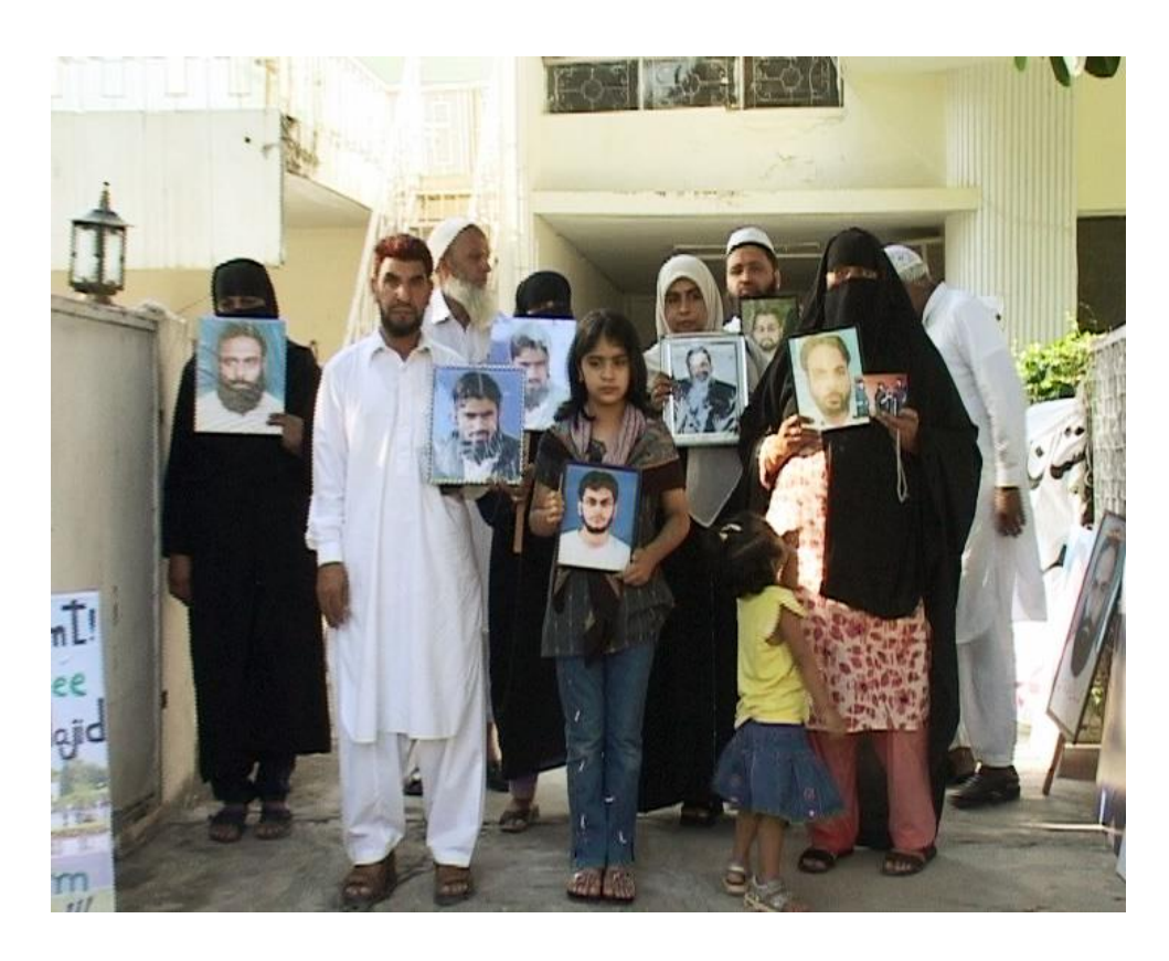
Relatives of victims of enforced disappearance, protesting outside HRCP Islamabad office, 29 September 2006