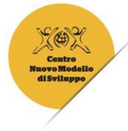
Centro Nuovo Modello di Sviluppo (Italy)