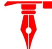
Labour Education Foundation (Pakistan)