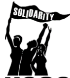
United Students Against Sweatshops (USA)