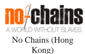
No Chains (Hong Kong)