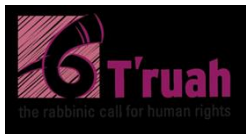
T'ruah: The Rabbinic Call for Human Rights (USA)