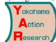
Yokohama Action Research (Japan)