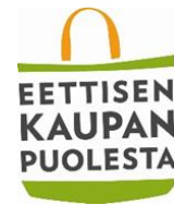
Pro Ethical Trade Finland/Eettisen Kanpan Poulesta (Finland)