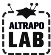
ALTRAPO LAB (Spain)