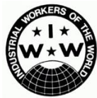
Industrial Workers of the World - North American regional Admin. (USA)