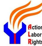
Action Labour Rights (Myanmar)