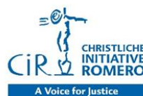
Christliche Initiative Romeo (Germany)