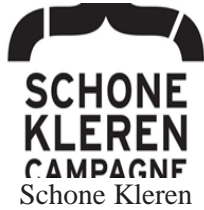
Schone Kleren Campaigne (Belgium N.)