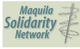
Maquila Solidarity Network (Canada)