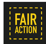
Fair Action (Sweden)