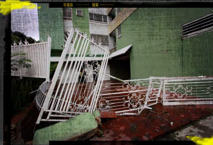
↑ Officers from the Anti-Kidnapping Command of the GNB, Military Counterintelligence, SEBIN, and groups of armed people jointly smashed down the entrance gate to the estate, shot firearms, tear gas grenades, and pellets.

In the community of La Isabelica in Valencia City, Carabobo state, on 20 July 2017, GNB officers fired pellets at people who were watching the protests, again in the absence of any justification for the use of force.