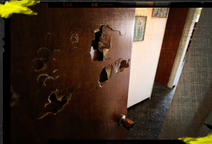
↑ Officers reportedly from CONAS and SEBIN raided the Victoria residential estate on Paez Avenue, in El Paraíso.

Similarly, on 26 July 2017, in the La Candelaria area of the capital, groups of armed civilians were active intermittently and possibly with the consent of the PNB. That same night, these groups were seen operating in a street while on the avenue leading off the street, police officials stood watching, making no effort to stop or prevent attacks by these groups.