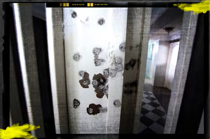
↑ Abuses in residential estates by officers of the SEBIN in Caracas.

Days after the security plan became operational, on 26 April, in the Sucre residential estate in Barquisimeto, Lara state, residents were attacked by armed groups of civilians as the GNB and Lara state police officials looked on. People consistently reported that officials and armed civilians acted in a coordinated fashion. They told Amnesty International that while the GNB were dispersing protesters, the “colectivos armados” threatened residents and opened fire on buildings.