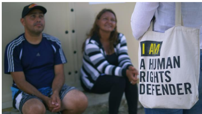
↑ Amnesty International interviewing a Venezuelan couple at CEBAF Peru in November 2019

Amnesty International would like to thank all the Venezuelan refugees who shared their testimonies as well as civil society organizations, humanitarian agencies and authorities with whom the organization met.