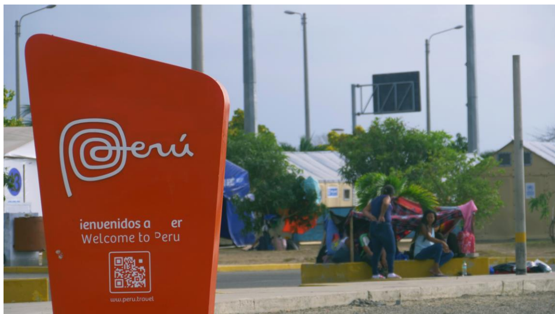
👁️ ↑ Diminishing welcome: since Peru introduced restrictions in June 2019, Venezuelans have faced increased barriers to accessing Peruvian territory and protection.

The notion of “indirect refoulement ”, also known as “chain refoulement ”, refers to the obligations on states not to remove a person to a third country from where they would be at risk of being returned to serious human rights violations. 142 Forcing people back to a country where their access to protection or another form of legal status is not guaranteed, also constitutes a form of indirect refoulement , as the ineffectiveness of a country's asylum system 143 in turn determines the risk of refoulement to the country of origin.