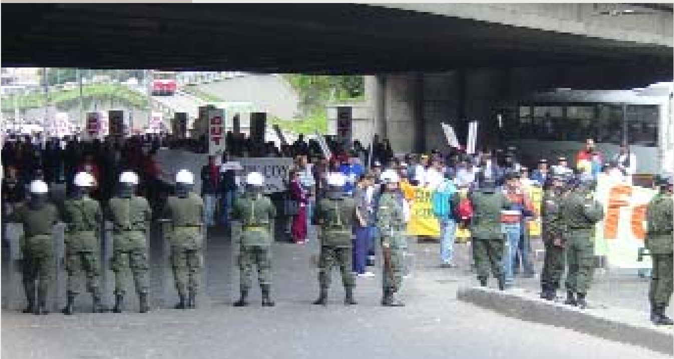
Demonstration by members of the CUT trade union confederation