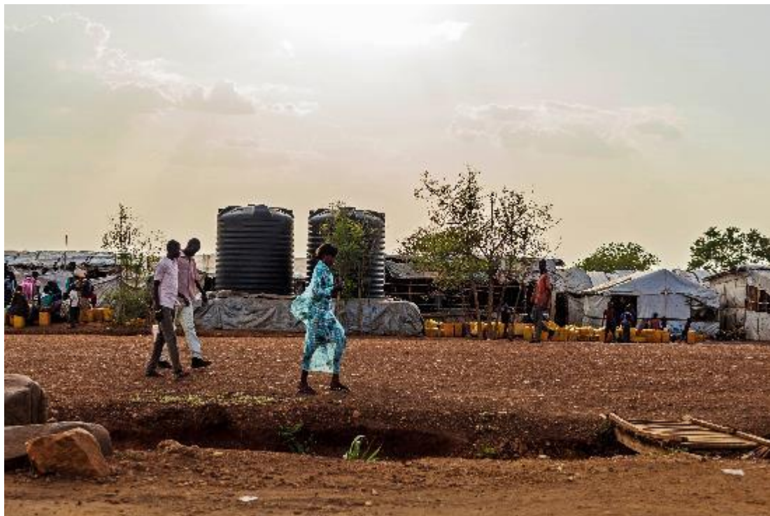
People walk through the Protection of Civilians site 3 in Juba, South Sudan.

The fighting that occurred between government and SPLA-IO forces in Juba between 8 and 11 July was marked by serious violations and abuses of international human rights law and international humanitarian law. Government soldiers deliberately killed civilians, fired indiscriminately in civilian neighbourhoods and around UN bases and PoC sites, and engaged in a massive campaign of looting civilian and humanitarian property. During the July 2016 violence in Juba, the government and SPLA-IO forces committed acts of sexual violence against women and girls. Most cases of sexual violence were committed by government soldiers, police officers and members of the National Security Services (NSS), particularly at checkpoints and during house-to-house searches. 135 In one highly publicized case, government soldiers raped and gang raped at least seven women, including foreign humanitarian workers, during an 11 July attack on the Terrain hotel in the Jebel neighbourhood. 136