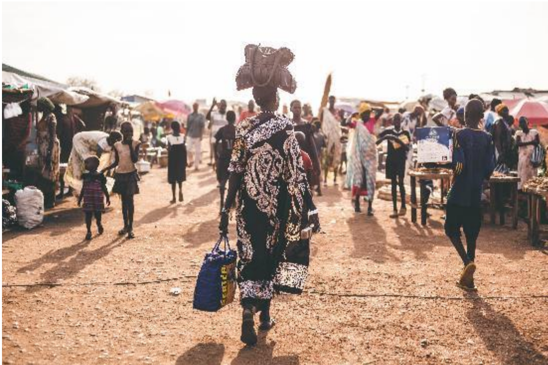
A woman carrying luggage on her head walks through the Protection of Civilians site in Juba, South Sudan.

Most of the cases investigated for this report involved rape or gang rape of women and girls, which often lasted for hours and left victims with serious injuries – both physical and psychological. Some rapists aggravated their crimes by other acts of cruelty, such as mutilating victims with knives or raping them with objects such as sticks. Some killed their victims outright while others left them bleeding, seemingly indifferent to whether they lived or died. Elderly women, young girls, and pregnant women have not been spared.