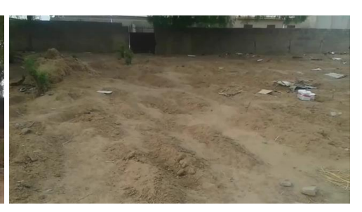
Recently disturbed earth by the southern gate of Gwange cemetery, Maiduguri. Witnesses saw BOSEPA staff bring bodies to the gate in a rubbish truck. These images show the likely site of grave. April 2016.

Mallam Babagana (not his real name) works by the side of the road a few hundred meters from the cemetery's southern gate. He told Amnesty International that since November 2015, a BOSEPA rubbish truck has visited the cemetery in the morning, two to three times a week.