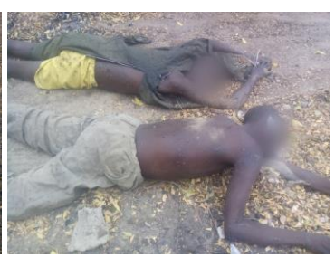
Corpses of detainees from Giwa Barracks, deposited at a mortuary in Maiduguri in February and March 2016.