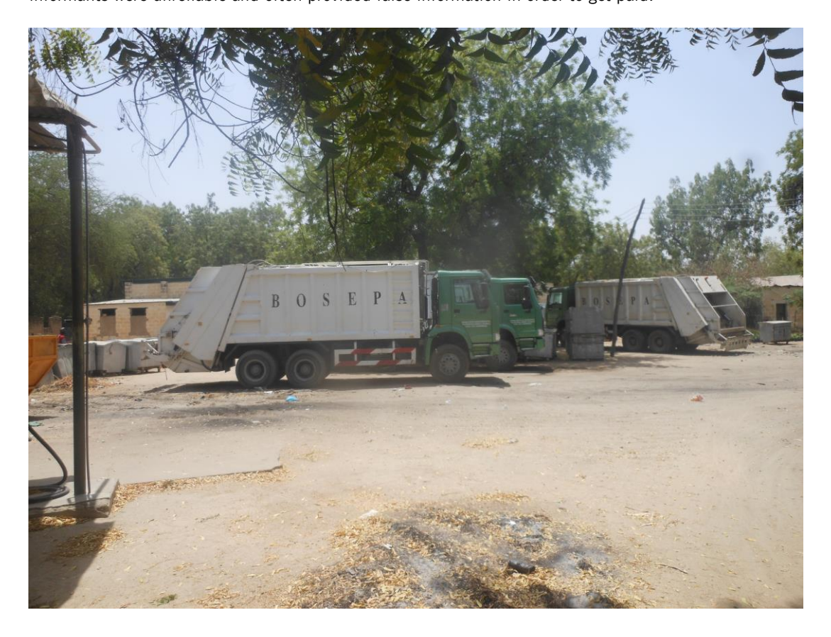
Borno State Environmental Protection Agency truck. These trucks were used to transport corpses from the mortuary to Gwange cemetery, Maiduguri. March 2014.

members, arbitrarily arrested at least 20,000 people since 2011. Most of those arrested were young men, although Amnesty International has recorded arrests and detention of boys as young as nine years old. The vast majority of arrests carried out by the military appeared to be entirely arbitrary, often based solely on the dubious word of an informant. On numerous occasions, particularly following Boko Haram raids, soldiers have gone to the town or village, rounded up hundreds of men and boys and taken into custody those identified as Boko Haram by informants. Military sources repeatedly told Amnesty International that the informants were unreliable and often provided false information in order to get paid.