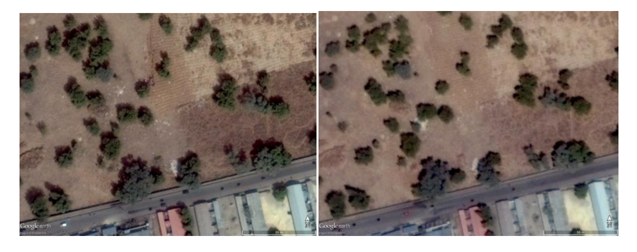
Satellite images show disturbed earth by the southern gate of Gwange cemetery, Maiduguri. These images were taken on 2 January and 17 February 2016.