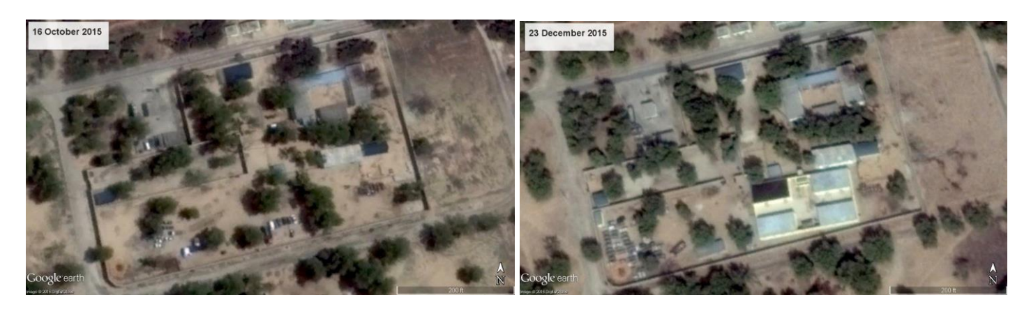
Satellite images show construction work in the detention facility at Giwa barracks between October and December 2015. These images correspond to the testimony of people detained n recently constructed cells in January 2016.