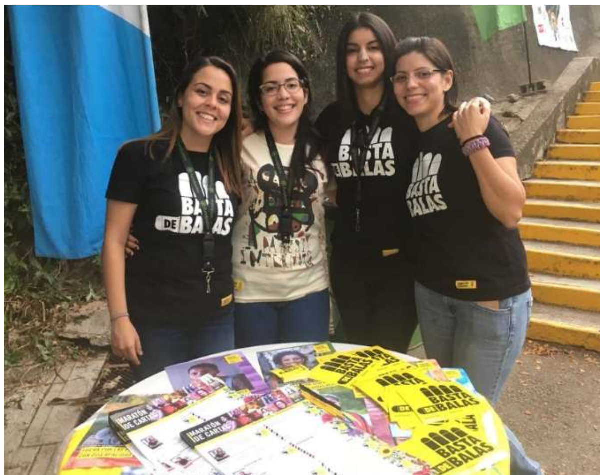
Young activists in Venezuela

The Women's Network promoted various activities, with actions carried out in different spaces such as plazas, theatres and at places like concerts, dances. The Section worked with young female influencers on social media, they supported the campaign and promoted the importance of human rights defenders and highlighted the attacks and violations faced by defenders throughout the world.