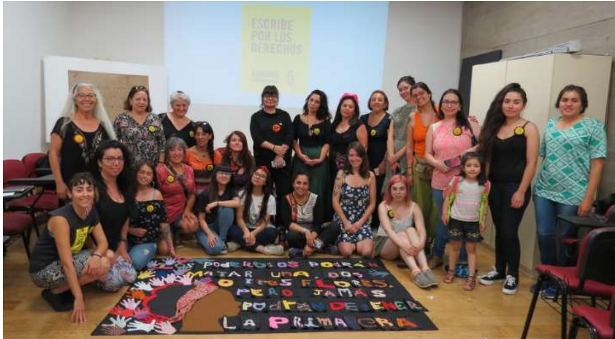
Activists take part in a Write for Rights event held by AI Chile.

Finally, thanks to the extra funds of the IS, the Section closed the campaign with the Recital Ellas Cantan for Human Rights, in which two famous Chilean singers participated free of charge, which brought together a large audience of all ages. This coincided with the commemoration of International Migrants Day, establishing interesting alliances with organizations for the rights of migrants, and holding a joint activism day that also allowed us to reach a new, larger and multicultural public.