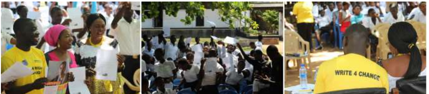
Activists at the launch event for Write for Rights in on 16th November, at Accra High School, Ghana

Youth activists were very involved, both at the National/Regional/Zonal, School and Group levels. The use of the Human Rights Friendly schools was by far the greatest tool for the Section and the campaign.