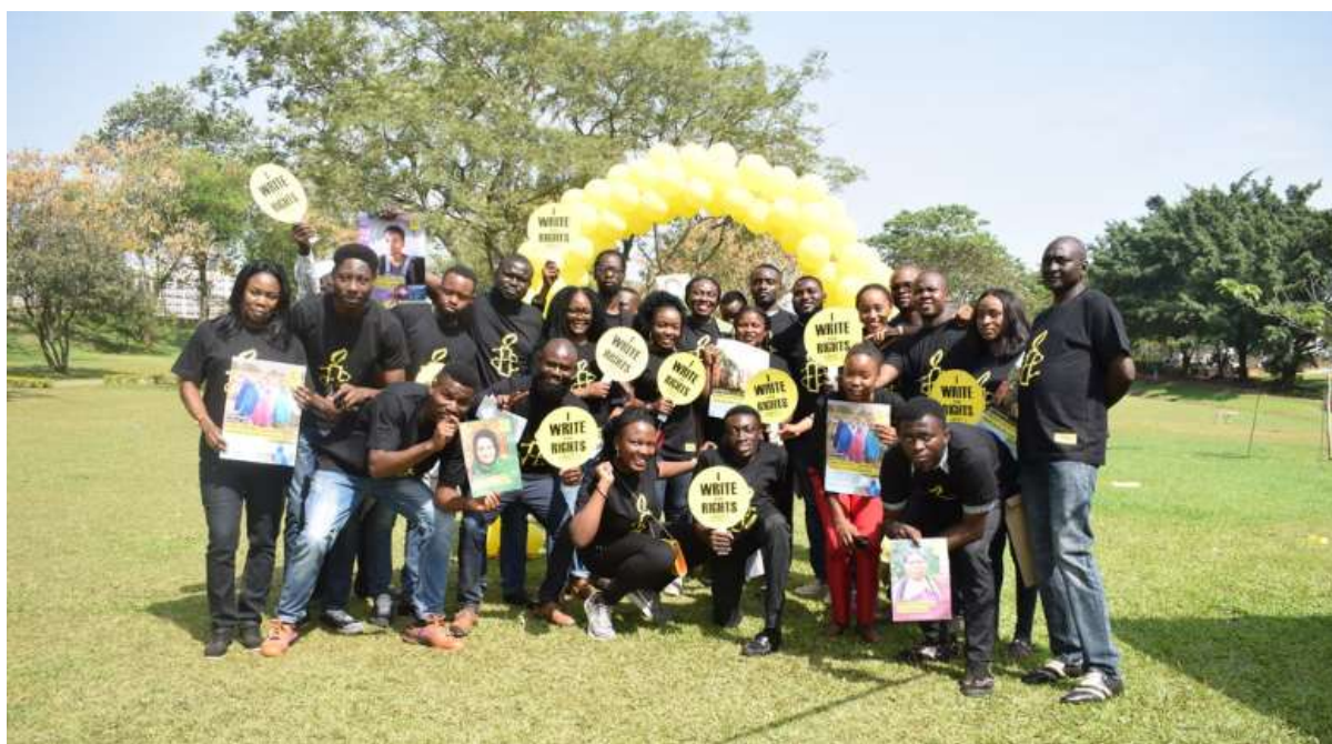
2018 Write for Rights even with AI Nigeria

Write for rights in Nigeria commenced with a national launch on 1 December. Thereafter, a total number of 23 events took place in sixteen (16) states across the country. Activists and supporters of Amnesty International in Nigeria and the public gathered in various events to write letters and sign petitions in solidarity with women human right defenders. Highlights of events ranged from friendly football matches, solidarity walks, youth neighbourhood gatherings, to write for rights action at a Nigerian law school. 10,457 actions were taken in support of cases from Kenya, Morocco, India, South Africa, Iran, and Brazil. As part of measures taken by AI Nigeria to bring Write for Rights global campaign closer to the ground in terms of national relevance the case of Knifar women was also promoted. The case gathered 3,572 actions. The facilitation of the various events across the states by coordinators of AI Nigeria supporters group was helpful in ensuring the success of the events. Collaboration with youth groups particularly the Young African Leaders Initiative (YALI Network) which is popular across Nigeria also helped. For example, in some states they offered their venues free to AIN supporters for Write for Rights. The solidarity walk in Nigeria's capital city was a first-time initiative which created more awareness and participation at the Write for Rights events.