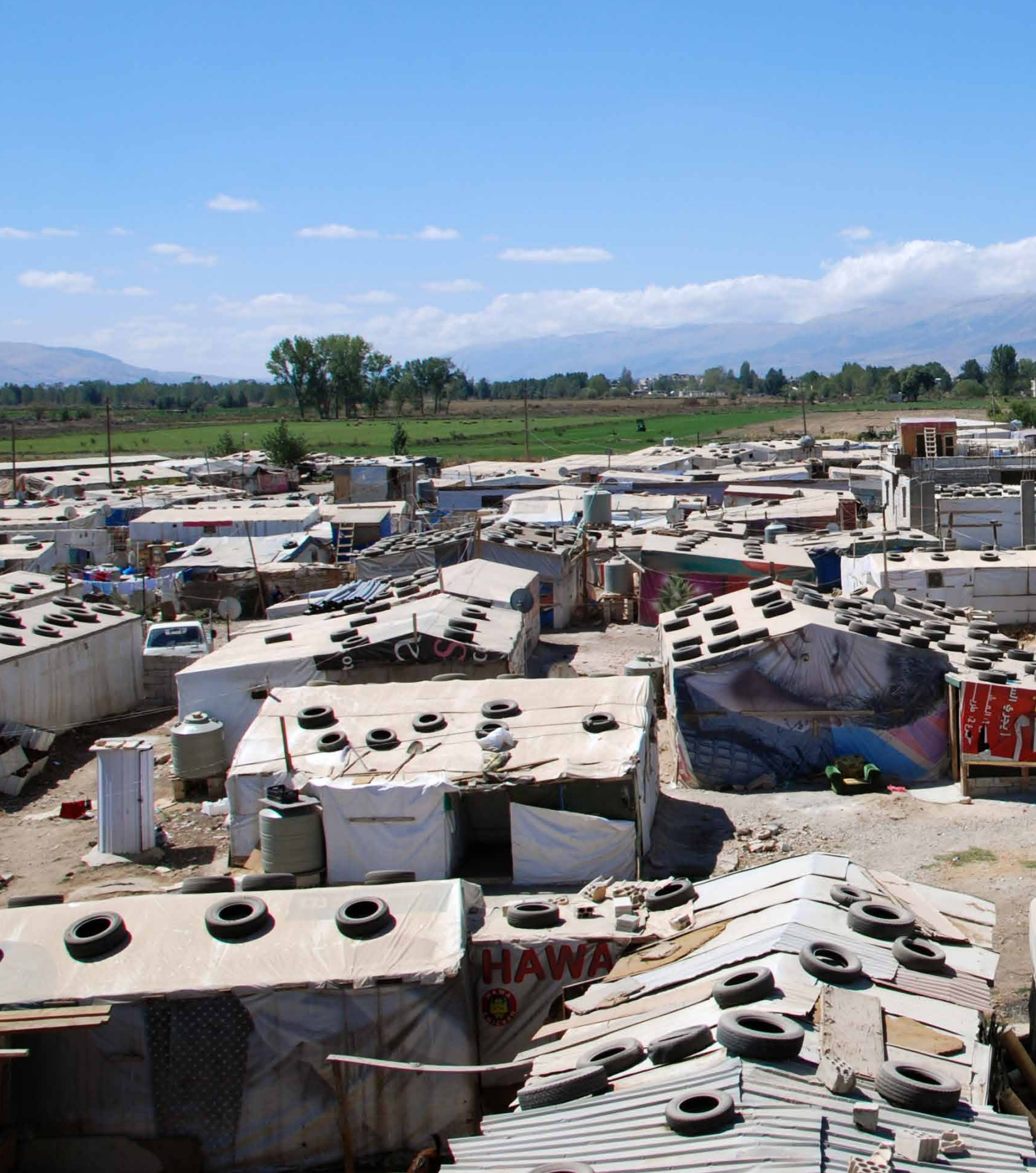
Jarahieh, an informal settlement for refugees from Syria in the Bekaa Valley, Lebanon. Many refugees in Lebanon live in inadequate accommodation including unfinished housing, overcrowded apartments and informal settlements, September 2014