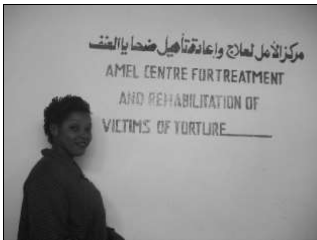
Staff member at Amel Centre for treatment and rehabilitation of victims of torture, Nyala, Sudan

After a month, the four women were brought to the office of the niyaba in front of a judge [name withheld] and told him that they were tortured into confessing they had participated in making a video. The judge reportedly ordered their transfer back to the office of the “positive” security, because they were trying to change their confession, where they were further tortured. The three members of the “positive” security responsible for their arrest told them: “The niyaba belongs to us, the positive security”. Ten days later, the women were transferred to hospital, after private lawyers demanded that they be medically examined. They are now under the authority of two members of the niyaba who appear to have seriously investigated their torture and have promised that they would be released if it is proven that they were tortured. However, the four women, along with the eight men arrested in the same case, have been charged with Articles 60, 63, 64, 50 and 146 of the Sudan Penal Code. Some of these articles carry the death penalty. Despite the medical examination being free of charge, the detainees or their relatives must buy their own medicine. The four women interviewed by Amnesty International are all responsible for the care of children or sick relatives. They were adamant that they did not know why they had been arrested and knew nothing about the alleged video tape.