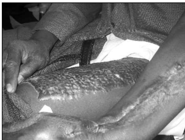
Victim of torture shows skin transplant, Sudan

Persons arrested by the Sudanese security forces have been routinely tortured. The most common form of torture or ill-treatment consists of heavy beatings, with hoses, whips, or boots. Some detainees have had their nails pulled out, others have been burnt with cigarettes. Sometimes detainees have been tied and hanged upside down. While the National Security Forces do not appear to torture every person they detain, most people remain at risk of torture upon arrest and during incommunicado detention. Those who escape torture are often well-known politicians, or persons who enjoy a high status in society; however, if the security forces believe that they have grounds to arrest well-known members of the society, they sometimes ill-treat them. Most acts of torture seem to aim at extracting confessions from detainees, sometimes with the view of instituting legal proceedings against detainees.