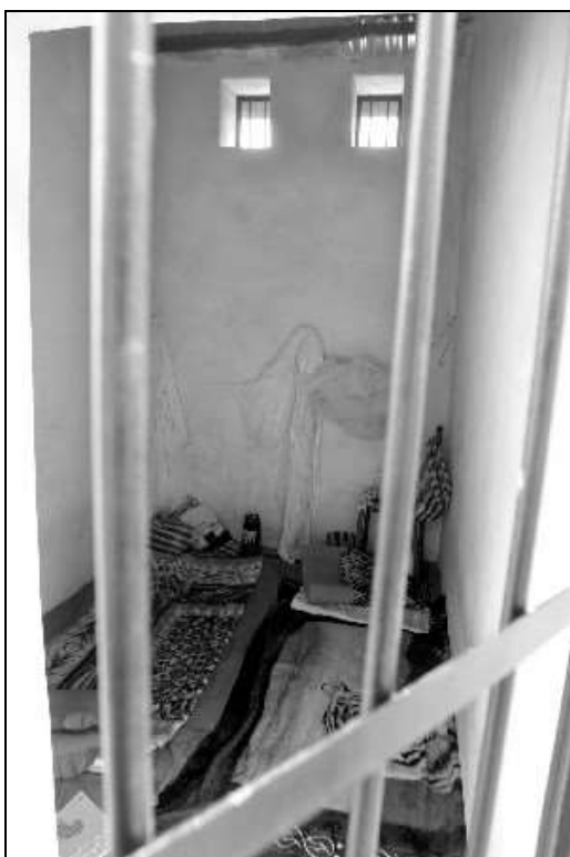
A prison cell at the National Security prison in Nyala, Sudan, visited by Amnesty Mission Delegates

In al-Fasher, the Director of the National Security was adamant that the Security Forces were given a legal mandate by the National Assembly and did not acknowledge the lack of safeguards for the detainees included in the National Security Forces Act. As regards incommunicado detentions, he said that relatives of detainees could contact the information office of the Security Forces in Khartoum. Even if the families knew that such an office existed and even if they had the courage to brave the climate of fear and intimidation surrounding security activities to complain to such a body, those living in Darfur would face obvious logistical and financial obstacles which would prevent them from obtaining more information on detained relatives.