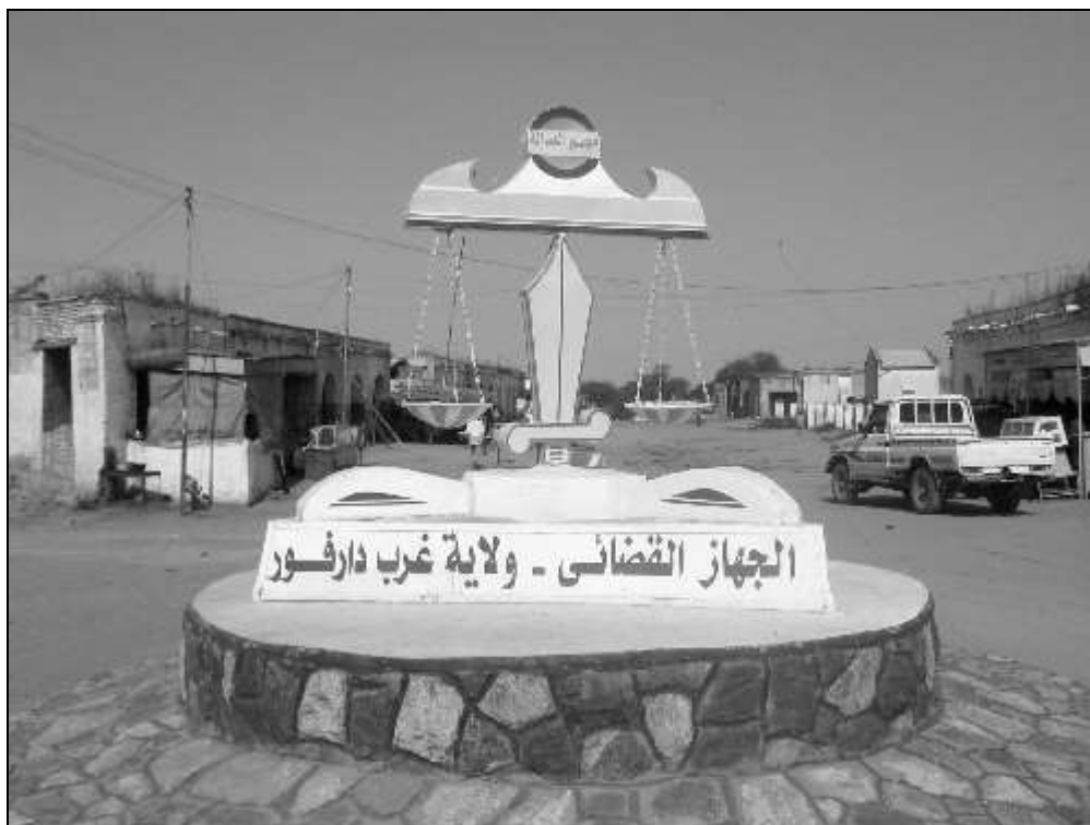
Scales of justice in al-Jeneina, Darfur, Sudan

The Sudanese authorities have undermined these rights in the Sudanese legal system, which contain trial procedures which are unfair and inconsistent with international standards. The authorities have also used the vagueness of certain articles of the Sudan Penal Code to criminalise criticism of the government.