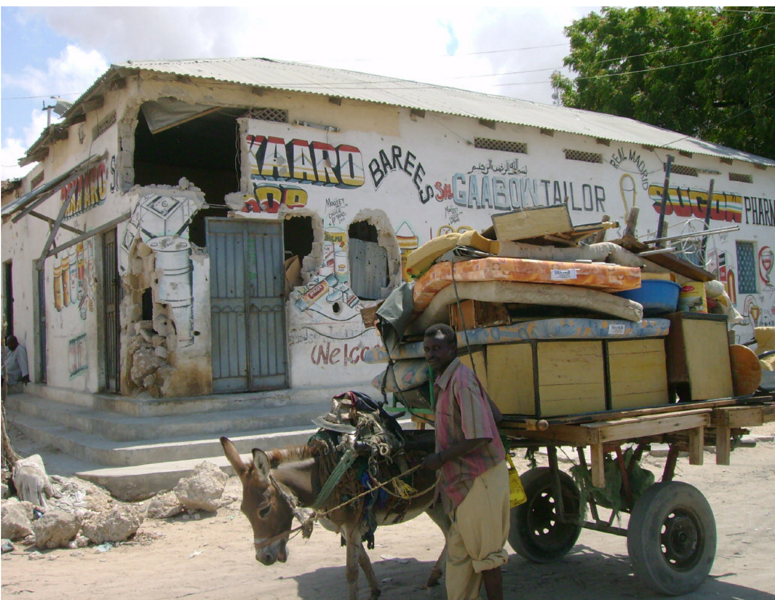
Displaced man near Hawlwadak, Mogadishu, April 2008.

suppress breaches of international law and prosecute those responsible for war crimes. War crimes may also be prosecuted in another country on the basis of universal jurisdiction.