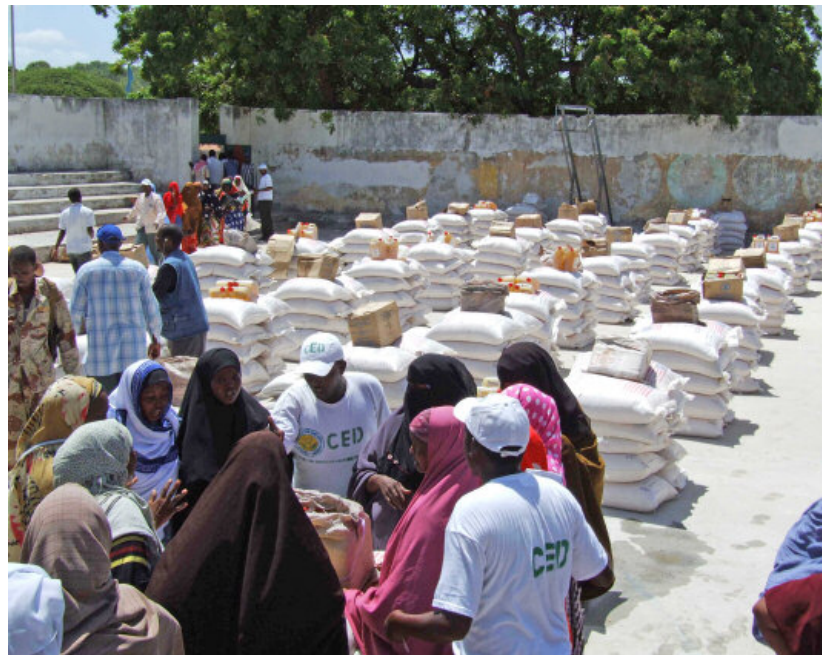
Distribution of food aid by a Somali humanitarian organization in Madina, Mogadishu, May 2007. Such aid is now under threat.

organizations, as the possibility that armed opposition groups are targeting their staff solely because of their work must be assessed, to ensure the safety of their staff and partner organizations. Currently many humanitarian organizations do not believe their staff are being targeted by armed opposition groups solely because of their delivery of emergency humanitarian aid or services; they have consequently assessed that they can continue delivering essential humanitarian aid and services in southern and central Somalia. However, the number of humanitarian staff killed