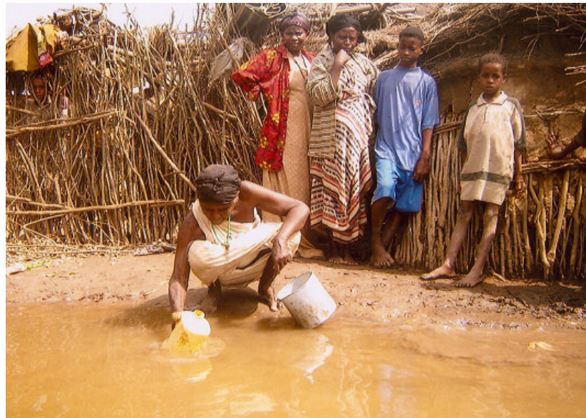
Gathering water: local resources have been depleted by the number of displaced people fleeing from Mogadishu.

Related to this is the fact that the cost of delivering humanitarian aid in Somalia has significantly increased. Security threats on land and at sea, illegal checkpoints, roadblocks and other means of extortion by authorities and armed groups alike have further added to the increased costs of food delivery. In August 2008, the UN reported that there were at least 325 roadblocks in Somalia, most staffed by TFG police or clan militias, and almost all demanding payment of