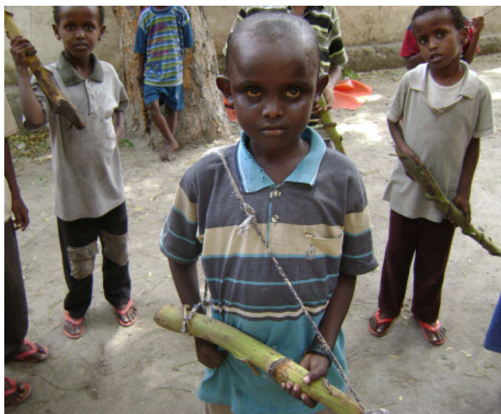
Somali children playing war games, Mogadishu, August 2008.