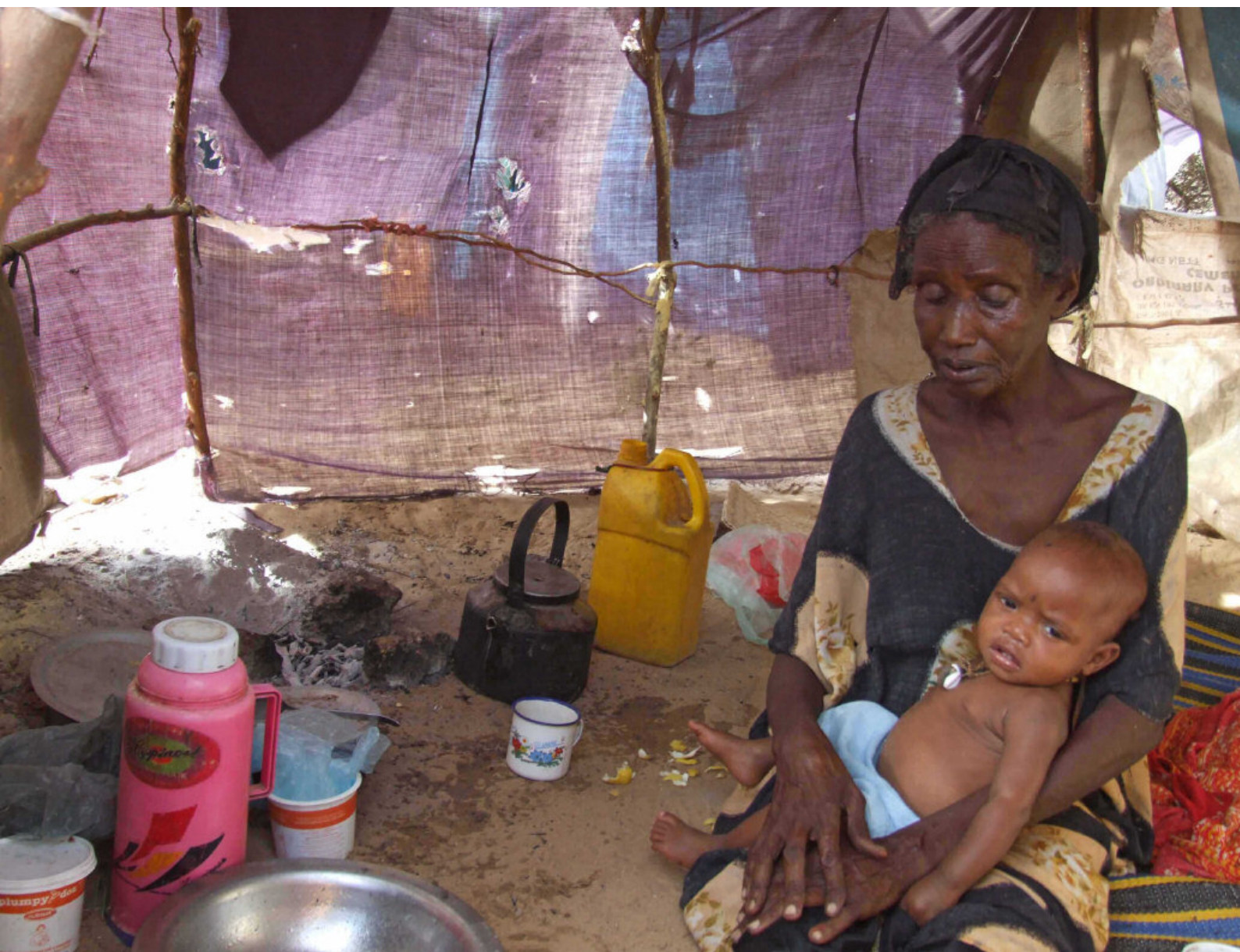
A blind woman, with her granddaughter, in Elasha camp for the internally displaced, April 2008. She was forced to flee from Baidoa in 1998, and from Mogadishu in 2007.