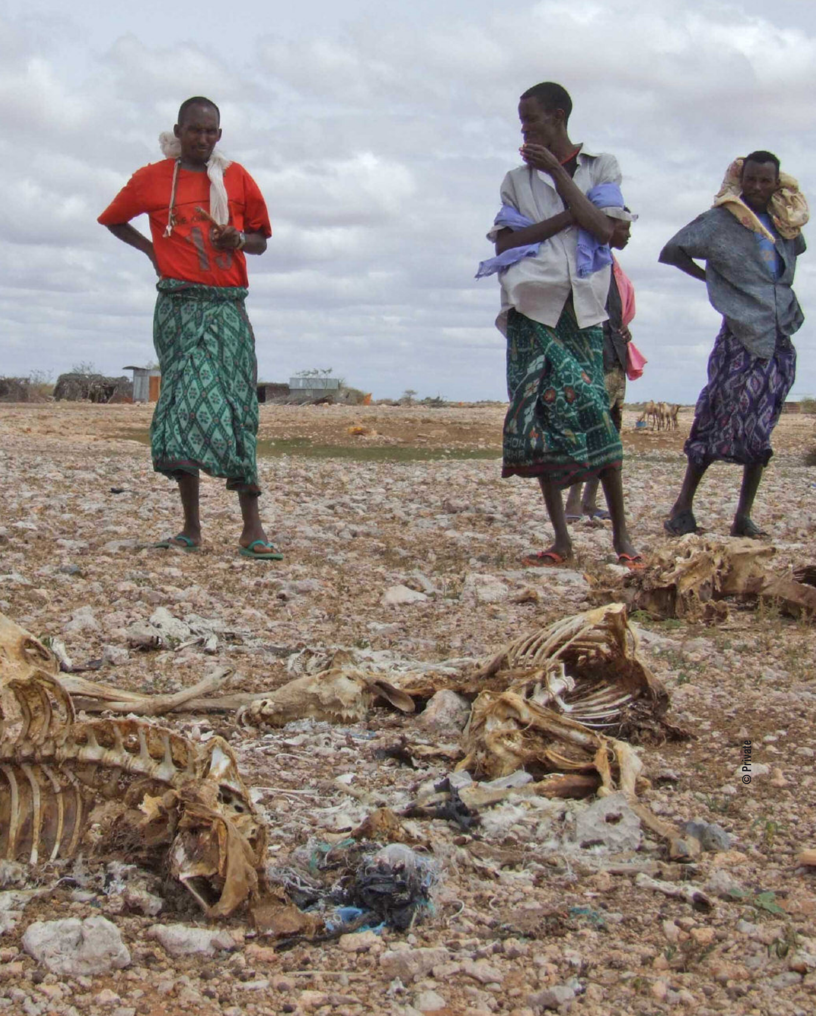
Men from the central region of Somalia who lost all their livestock during the 2008 drought.