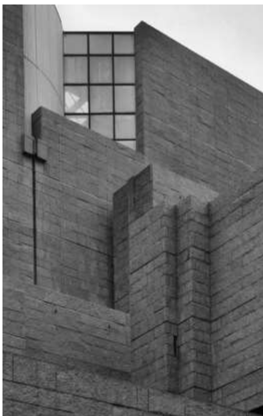
The Supreme Court of Japan, Tokyo. Death sentences are initially imposed by the court of first instance, the District Court, where the case is first heard. On appeal, the case transfers to the High Court and final appeals are heard in the Supreme Court.

balance between the crime and the punishment as well as that of general prevention, taking into account ... the nature, motive and mode of the crime, especially the persistence and cruelty of the means of killing, the seriousness of the consequences, especially the number of victims killed, the feelings of the bereaved, social effects, the age and previous convictions of the offender, and the circumstances after commitment of the crime.” 44