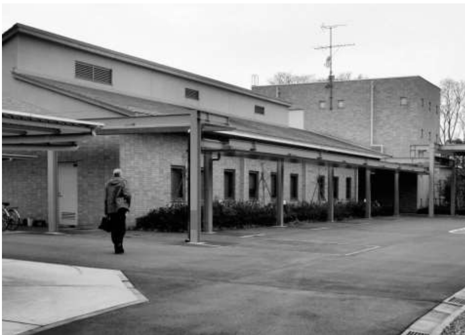
Tokyo Forensic Unit is one of more than 30 such units throughout the country established to allow for the evaluation of the mental health of detainees. The majority of residents in the Tokyo Forensic Unit are diagnosed with schizophrenia.

The policy also affects families of death row prisoners who are not told of the execution until after it has occurred. In one case, a mother arrived at the prison to visit her son to be told to come back later. When she did, she was told that he had been executed. 101 Again the rationale for this cruel policy is explained in benevolent terms for both family and prisoner: