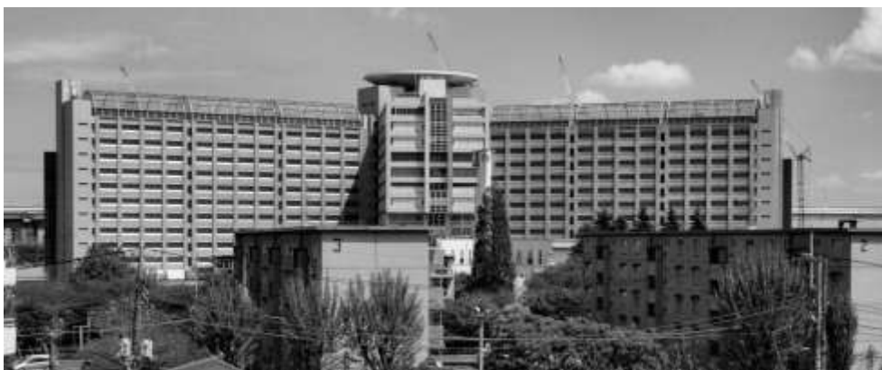
Tokyo Detention House, one of seven locations in Japan where prisoners are executed. Prisoners under sentence of death remain in solitary confinement for many years and even decades in a facility that is essentially designed for pre-trial detention.

This report draws a number of conclusions and makes several recommendations for the government of Japan and to Japanese health professional bodies. The principal recommendations to government and to health professional organizations, set out in full below (pp. 60-63), are: