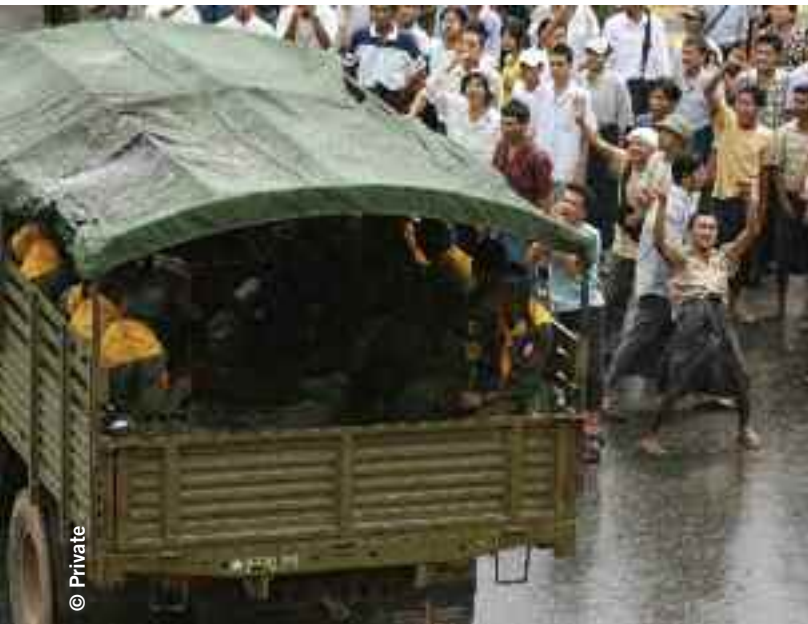
Security forces arrive at a demonstration in the centre of Yangon, September 2007.

‘The authorities cut the phone lines at about five in the afternoon. At ten past nine that night, they crashed open the main gate of the monastery with their military trucks. They started beating the monks as soon as they came in. They kicked open the main door of the monastery after they crashed open the gate. They beat us indiscriminately as soon as they got inside the building. It was a preventive strike so that the monks could not resist the attack. They ordered us to stand against the wall and hit the monks who did not obey their orders with sticks.’