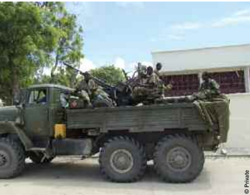
Armed Ethiopian soldiers on a “technical” in Mogadishu, May 2007.

‘On 16 October 2007 I was in Somalia. On the fourth night I was there the village was occupied by Ethiopians. I was among 41 who were arrested by the Ethiopians. We were taken to the military base. I could see the battle wagons, and more than 15 technicals [jeeps mounted with light weapons]. I was questioned by a Somali guy who was working with the Ethiopians. We were all asked the same question: “Why are you here?” We said we were just living in our homes.’