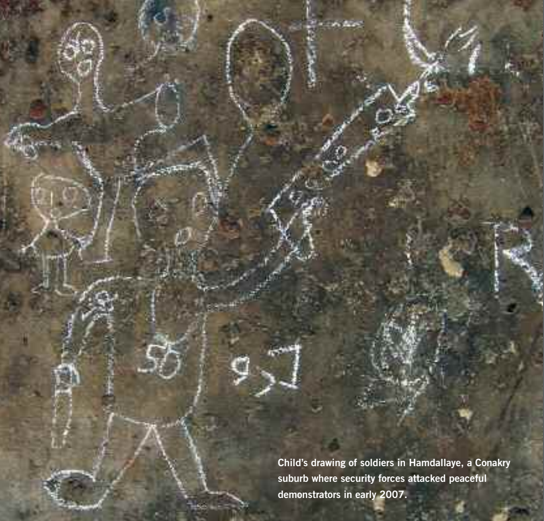
Child's drawing of soldiers in Hamdallaye, a Conakry suburb where security forces attacked peaceful demonstrators in early 2007.