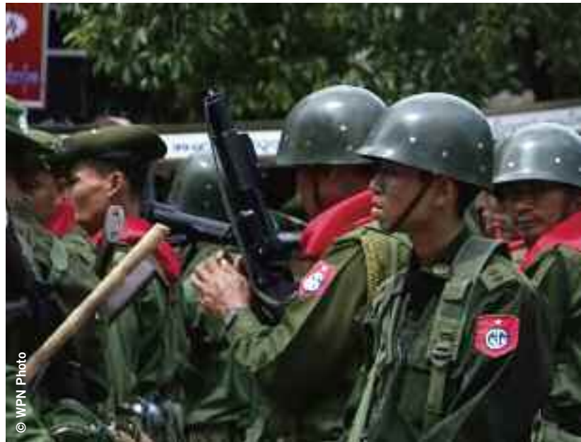
Grenade launcher used by Myanmar security forces during demonstrations in Yangon, 28 September 2007.

To adequately protect human rights, an ATT must cover military, security and policing arms, and related equipment of all types. It must not be limited only to the eight categories proposed by some states – the seven categories of vehicles, artillery and missiles included the UN Register of Conventional Arms, plus small arms and light weapons. For example, military transport and utility vehicles, not currently covered by the UN Register, are widely used in both military and internal security operations. During the crackdown, Myanmar's security forces used distinctive Chinese-made army trucks, several hundred of which have been delivered to Myanmar since 2005, to raid monasteries, and to transport and co-ordinate security forces.