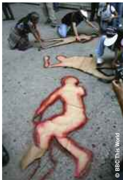
Women protest against the high murder rate of women in Guatemala and the lack of action by the state, November 2005.