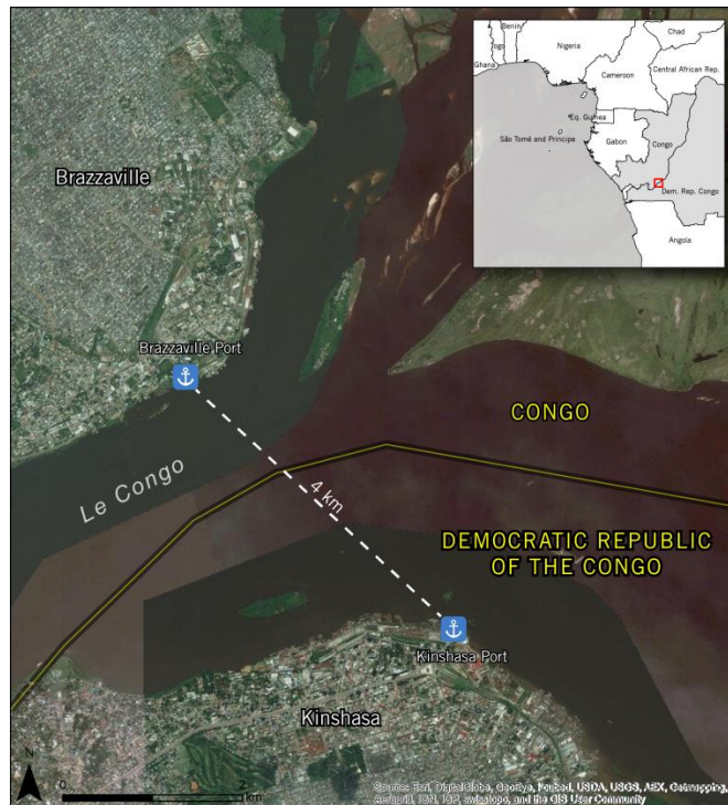
Satellite image showing the distance between Brazzaville and Kinshasa ports. This map should not be interpreted to represent Amnesty International's view on questions of borders or disputed areas and their names.

Between 16 May and 7 September 2014, 21,381 persons passed through the Cosmos transit site, 23 opened by several UN agencies next to the port. 24 Mass expulsions of DRC nationals ended in September 2014.