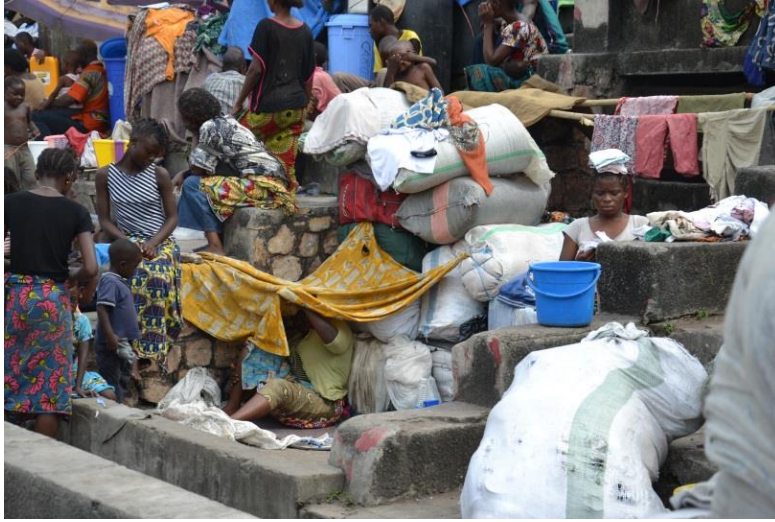
Many of those arriving in Kinshasa were initially sheltered at Cardinal Malula Stadium. Here, a woman uses a piece of fabric as a makeshift shelter.