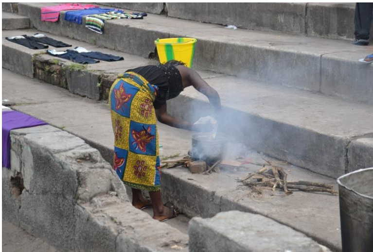
A woman prepares a meal on the terraces of Cardinal Malula Stadium in Kinshasa where many arriving from Brazzaville were initially sheltered.