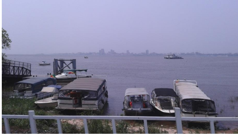
View of Kinshasa from the port of Brazzaville.

Although expulsions are not mentioned as a main line of action in the concept note describing the operation, Amnesty International's research demonstrates that the core of operation Mbata ya Bakolo consisted of mass expulsions of DRC nationals, mostly irrespective of their migration status. According to the government of the Republic of Congo, 158,724 families, that is about 245,000 DRC nationals, returned "voluntarily" to DRC during the operation. 25 According to the DRC government, operation Mbata ya Bakolo resulted in the deportation of at least 179,452 nationals of the Democratic Republic of Congo (DRC). 26 Over 40% of those registered in the DRC (73,614) were minors. At least 60 of them were refugees or asylum-seekers. 27 A number were migrants who were lawfully residing in the country. 28