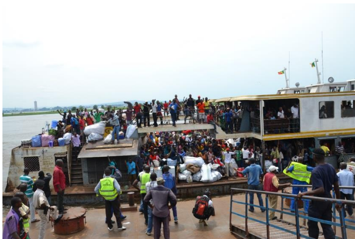
During operation Mbata Ya Bakolo , thousands of DR Congo nationals arrived back in the country every day. While some were able to return with their personal effects, this was not the case for all.

In the case of the Republic of Congo, the human rights violations and abuses committed in the framework of operation Mbata ya Bakolo and outlined in this report caused many DRC nationals to leave the country. Their returns constitute disguised expulsions, in violation of several international law obligations to which the Republic of Congo is bound, including: Article 33 of the 1951 Convention relating to the Status of Refugees; Article 3 of the UN Convention Against Torture; Article 13 of the International Covenant on Civil and Political Rights; Article 2.3 and 5.1 of the African Union Convention Governing the Specific Aspects of Refugee Problems in Africa; Articles 7 and 12 of the African Charter on Human and Peoples' Rights (see below).