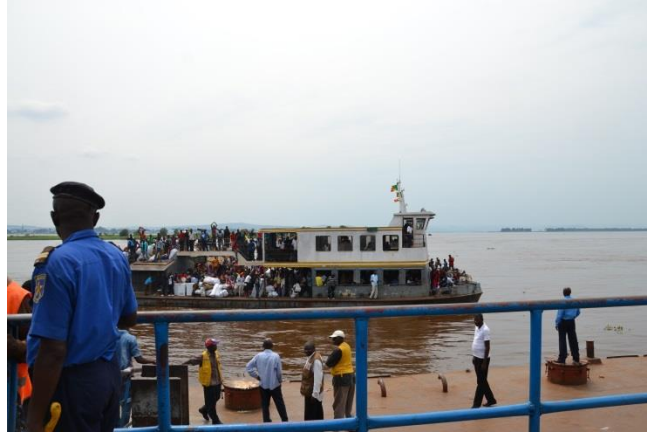
Boats ferried DR Congo nationals expelled from the Republic of Congo. During the peak days of the operation, 7,000 to 8,000 people arrived in Kinshasa daily.