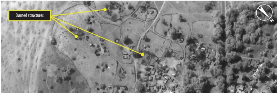
Figure 3. Imagery on December 29 shows many structures in the southwest area have been damaged or destroyed.

DigitalGlobe Panchromatic Imagery, December 29, 2014, 11.1737°, 14.2442°