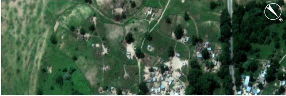
Figure 2. On October 4, imagery shows the southwest area of Doublei.

DigitalGlobe Natural Color Imagery, October 4, 2014, 11.1737°, 14.2442°