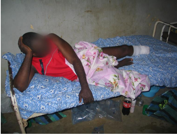
A 43 year-old man had his leg amputated following the suicide attack at the Maroua market, July 2015.

A 32 year-old trader at the central market told Amnesty International that he saw the suicide bomber who was a young girl "dressed like a beggar". 130