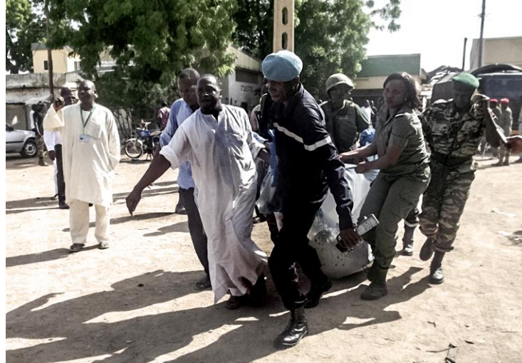
Security forces carry the remains of one of the victims of the blasts in Maroua, 22 July 2015.

"There's a truck-loading station in Barmare, where lorries get ready to travel to other markets of the region or to Chad. There were many people when the bomb exploded. I was having lunch in a small restaurant. I don't know how I was not wounded, I really thank God. After the explosion, there was panic and people were screaming. I saw at least 5 dead bodies. I helped those wounded and tried to comfort them." 333