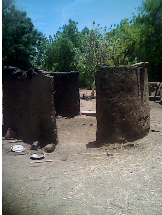
One of the houses destroyed in the village of Doublé, December 2014.

Looting of homes by the security forces was reported and witnesses described how security forces stole money and other goods in front of them, while supposedly searching the premises.