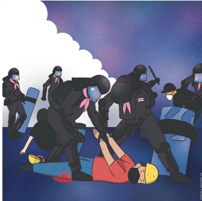
Visual illustration of Sainam’s experience of the violent arrest by police officers during a protest crackdown / © Amnesty International / Summer Panadd

Section 69 of Thailand’s Act on Juvenile and Family Court and Juvenile and Family Case Procedure (“Juvenile Court Act”) prohibits the use of “restraining tools” for arresting children in every case, except if it is of the utmost necessity to prevent the child from running away or to ensure the safety of the child or others. 62 It also requires the officer who arrests a child to inform them of their arrest, as well as charges against them and their legal rights. Amnesty International’s documentation shows that the police officers did not comply with this procedure in the arrest of Sainam.