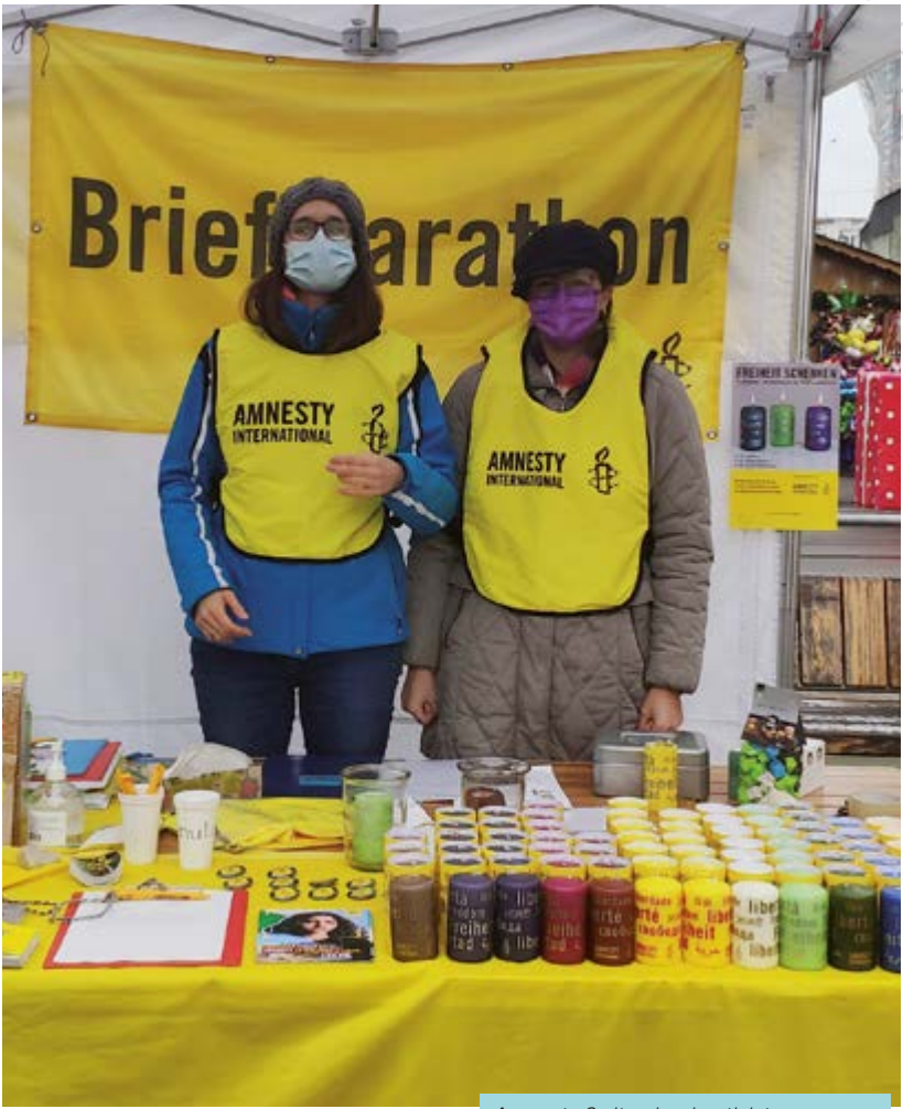
Amnesty Switzerland activists participate in Write for Rights 2021.

Human rights are not luxuries to be met only when practicalities allow.