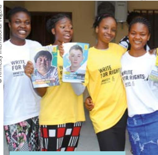
Amnesty Nigeria activists participate in Write for Rights 2021.

Read about the people we're fighting for: www.amnesty.org/writefor-rights