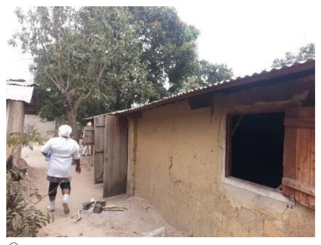
\textcircled{O} \uparrow_{\textit{Louloumbo}} Integrated Health Centre O private