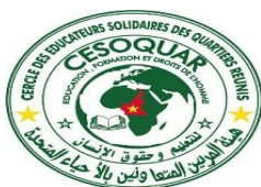
Cercle des Educateurs Solidaires des Quartiers Réunis (CESOQUAR)