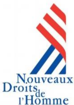
Plate-Forme de la Société Civile pour la Démocratie