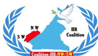
Civil Society Coalition on Human Rights and Peace in the North-West and South-West (The Coalition)