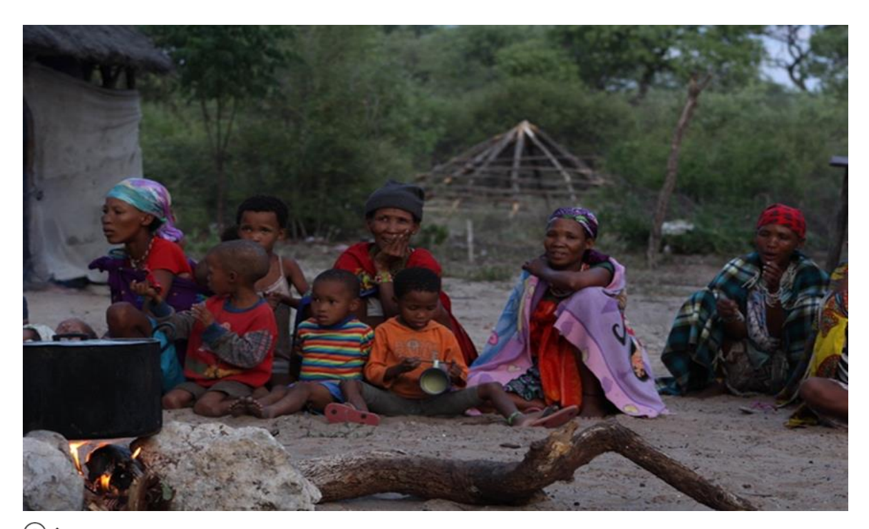
A community sit around the fire while sharing health messages with the local field staff from Health Poverty Action who regularly run informal sessions with the whole community in Dun Pos to ensure they understand their rights.