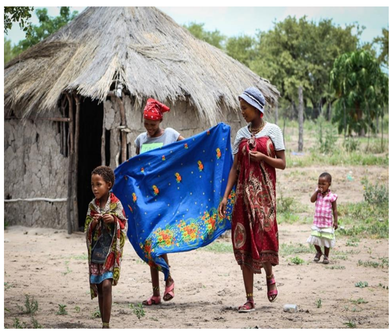
Family in Dun Pos village, near Tsumkwe.

should seek the support of the International Community, who must provide necessary financial and technical support to the Namibian government to extend appropriate healthcare services to San communities.