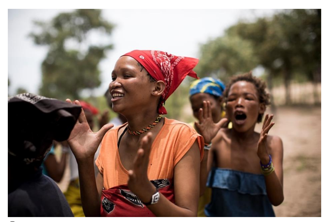
♠ Local women doing a traditional dance at Dun Pos, one of the remote villages near Tsumkwe.

Indigenous children are also protected by the Committee on the Rights of the Child's General Comment No. 11, ^{113} which illustrates how the Committee interprets the state's legally binding obligations under the Convention. It outlines that: "States Parties should take the necessary steps to ensure ease of access to health care services for indigenous children. Health services should to the extent possible be community based and planned and administered in co-operation with the peoples concerned. Special consideration should be given to ensure that health care services are culturally sensitive and that information about these is available in indigenous languages". ^{114}